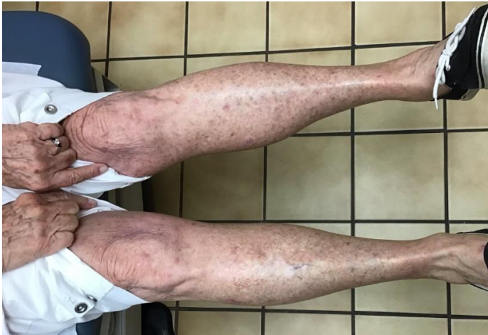
Figure 3. After treatment, the patient presented with no new lesions and the previous lesions were resolved with remaining post-inflammatory hyperpigmentation.

patient was therefore prescribed varying prednisone tapers. Despite improvement of the eruptions on oral prednisone, the patient developed side effects, which included: weight gain, swelling, moon facies, elevated blood pressure, bleeding gums, and blurred vision.