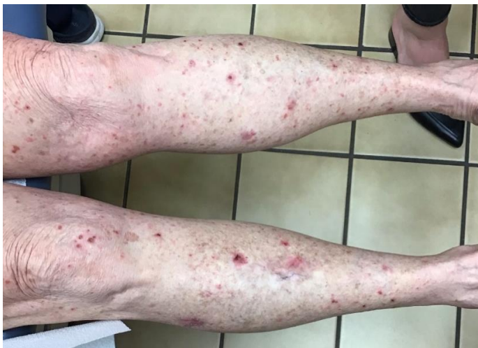
Figure 1. Erythematous vesicles and bullae in various stages of development and healing on the bilateral lower legs.

Therefore, 3mm punch biopsies were obtained for direct immunofluorescence (DIF) and hematoxylin