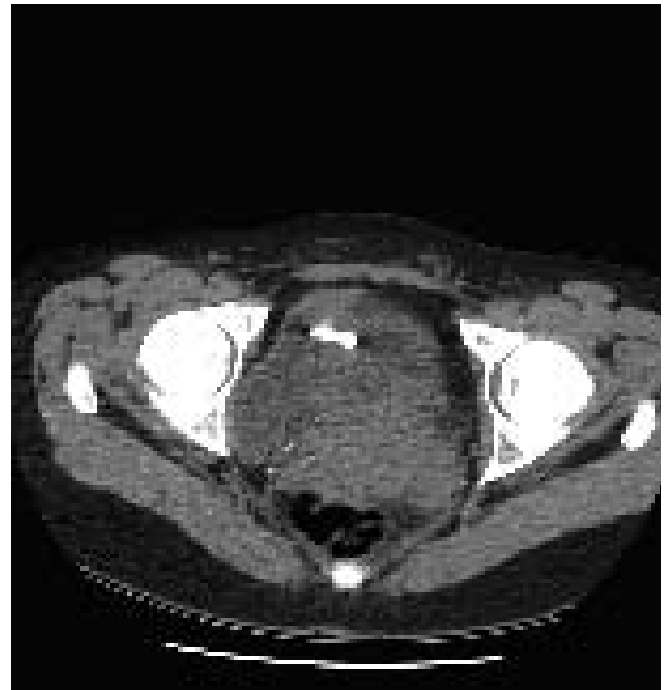
Figure 2. CT of an IUD extruding from the vagina into the bladder.

Most reports of IUD perforation of the bladder have occurred with the Lippes Loop or the Copper T devices. 5