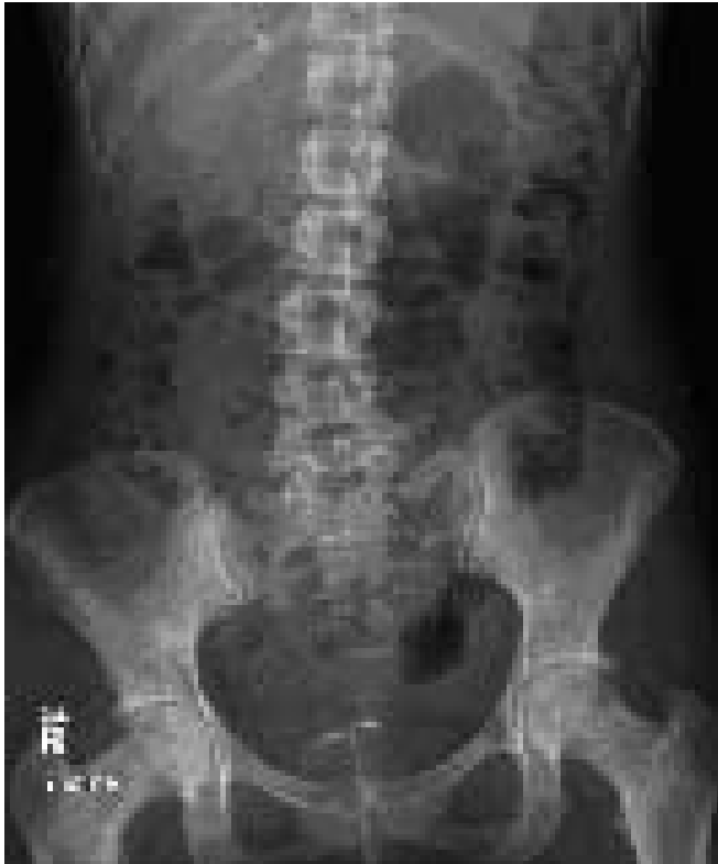
Figure 1. AP View of the Abdomen with a T-shaped IUD in the suprabubic region.

undergone colposcopy one month prior to presentation, which was reportedly normal. The patient had a history of IUD placement five years prior to presentation. One month after IUD insertion the patient developed abdominal pain and returned to clinic. According to the patient, the IUD was removed and her pain resolved. The patient was without complaints until one year prior to presentation when she developed suprapubic pain, voiding symptoms, and occasional hematuria for five months.