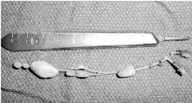
Figure 5: IUD post removal from bladder.

Two types of uterine perforation have been characterized. Partial perforation is described as perforation that may advance through all the layers of the uterus, but some part of the IUD is retained within the uterine cavity or wall. An IUD may also be described as “embedded” to varying degrees within the uterine wall. 2 Complete perforation occurs when all the layers of the uterine wall have been crossed, including the endometrium, myometrium, and serosa. 2 With complete perforation the IUD may be free in the peritoneal cavity or embedded in nearby structures or