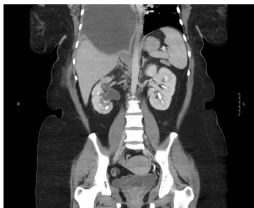
Fig. 1. A large right staghorn calculus and moderate hydronephrosis at upper pole (A). Final CT scan with contrast showing minimal stone residuals on day of discharge (B).