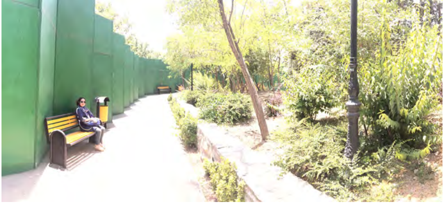
Figure 4. Fences that control the inside view from the outside.

providing legal protection for all, as well as the equality of all before the law.” 8 Women in Iran, however, in their quest for political and gender equity, suffered throughout the history, and none of these codes was fully applied in actual life.