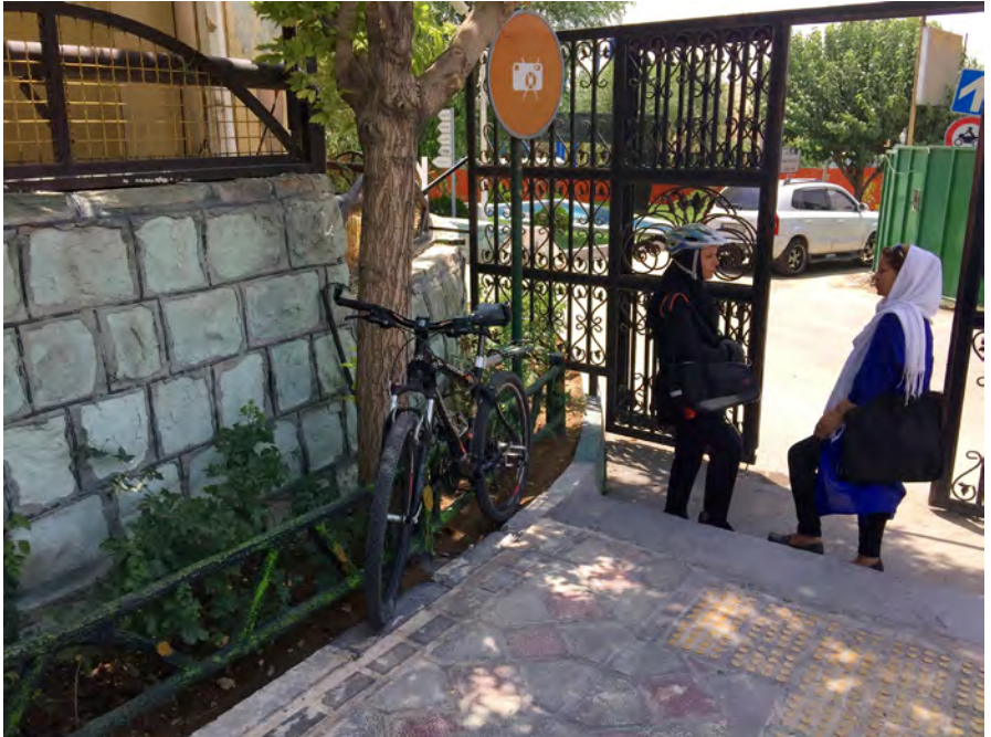
Figure 8. All cellphones and cameras are banned inside the protected park area

park and showed their satisfaction with the control factor. The interviews revealed that the majority of women users found the women-only park a safer place than other parks in the city. For them, the safety was a result of having women security guards and women staff working in the fenced park area (Sinaiee, 2008). In other words, the contradictory notions of freedom and control were considered positive factors to mark this women-only space a successful design.