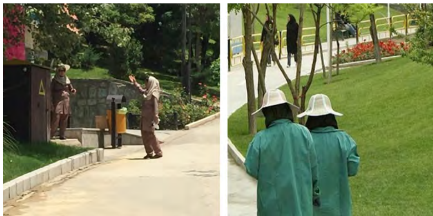
Figure 5. The park's women staff are in charge of management, security, gardening, and other responsibilities.

In 2005 Mahmoud Ahmadinejad became the president of Iran and Mohammad Bagher Ghalibaf was appointed Tehran's mayor. They were both in the group of conservative politicians. With the help of Ghalibaf, however, it signaled the start of a new phase of transformation and ideological change in the capital city. In 2007, the opening of Mother's Paradise reaffirmed women's