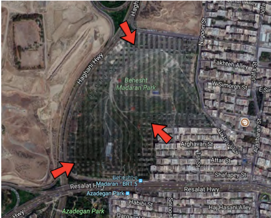
Figure 1: Location of Mother's Paradise in Tehran. The red arrows point towards the entrance gates.

Management, development, maintenance, and supervision of public open spaces, recreation centers, tourist resorts, parks, and urban greenbelts in cooperation and collaboration with the governmental, public and civil organizations, and participation of the Tehrani citizens according to the rules and regulations of the ratified master plan and ratified detailed plans. 2