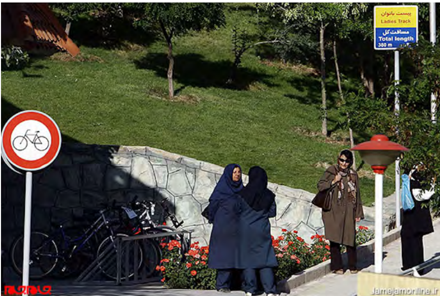
Figure 7. Biking area inside Mother's Paradise.

The notion of safety was also expressed by The National, a private English-language daily newspaper published in Abu Dhabi, United Arab Emirates. The newspaper article reported on interviews with women users of the same