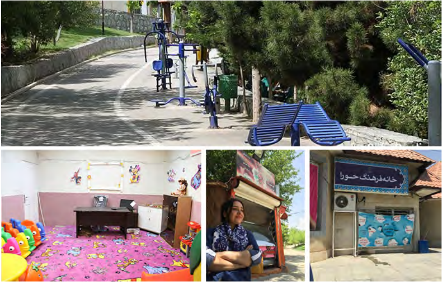
Figure 6. Upper image: sports facilities and walking paths inside the park; Lower right image: Houra Cultural Center; Lower middle image: A kiosk and coffee shop in the park; Lower left image: Playroom for kids

The park is monitored for 'proper behavior' both inside and outside the fences. A team of 15 male security guards controls three main entrance gates, in order to stop outsiders from ogling women who use the park. They are the only men who are involved with park use. The online magazine Vista News Hub reports that a team of 35 women is in charge of control and management inside the park area (Mousavi Khesal, 2015).