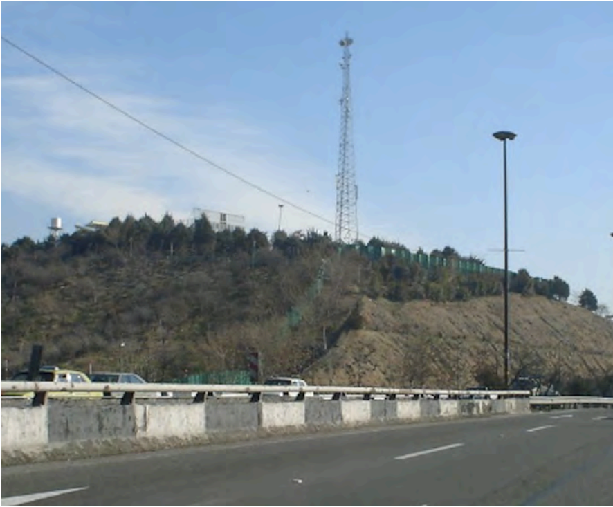
Figure 2. Borders that territorialize the gender-segregated area of Mother's Paradise Park from surrounding environment.

In a search for a solid definition of Iranian-Islamic identity and culture, I looked to the Ministry of Culture and Islamic Guidance website ( www.farhang.gov ). 5 The 5th and 12th principles under Content Strategies emphasize “the attributes of Iranian-Islamic identity” and “Iranian-Islamic culture” without mentioning what those attributes are or how this term should be defined. However, the composite expression Iranian-Islamic has been used extensively in IRIB, the state-sponsored media. 6 This research will further