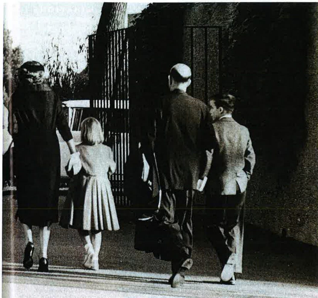
Greek Theatre after his inauguration as president of the University of California on September 29, 1958.

A PUBLIC MEMORIAL FOR CLARK KERR WILL BE HELD AT 3 P.M. ON FEBRUARY 20 AT ZELLERBACH AUDITORIUM. THE PUBLIC IS INVITED TO ATTEND.