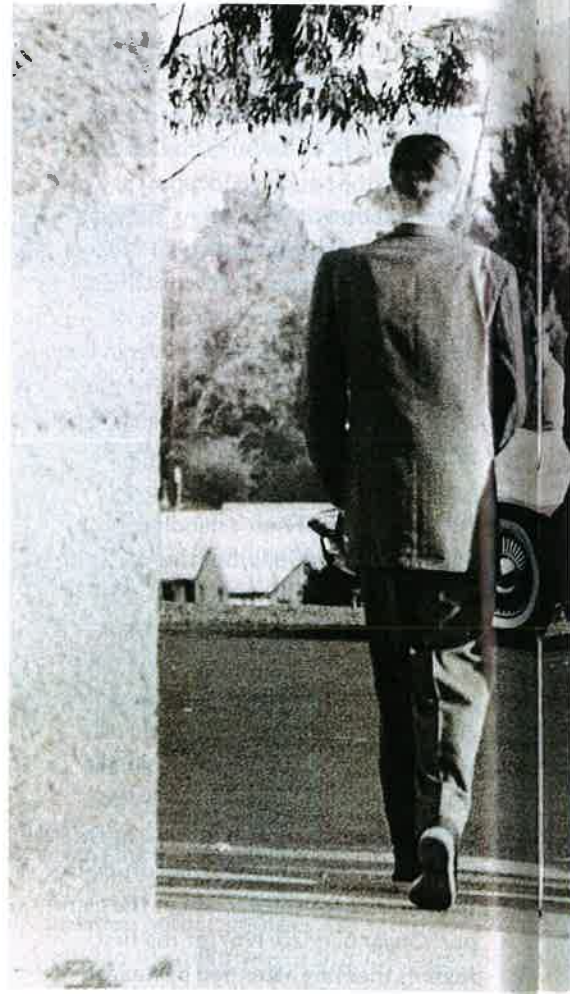
FAMILY LEAVE: Clark Kerr and his family exit the Gree