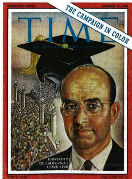
COVERING THE CAMPUS: Time magazine, on October 16, 1960, praised Kerr’s Master Plan and marveled at the “tidal wave” of students coming through Sather Gate.