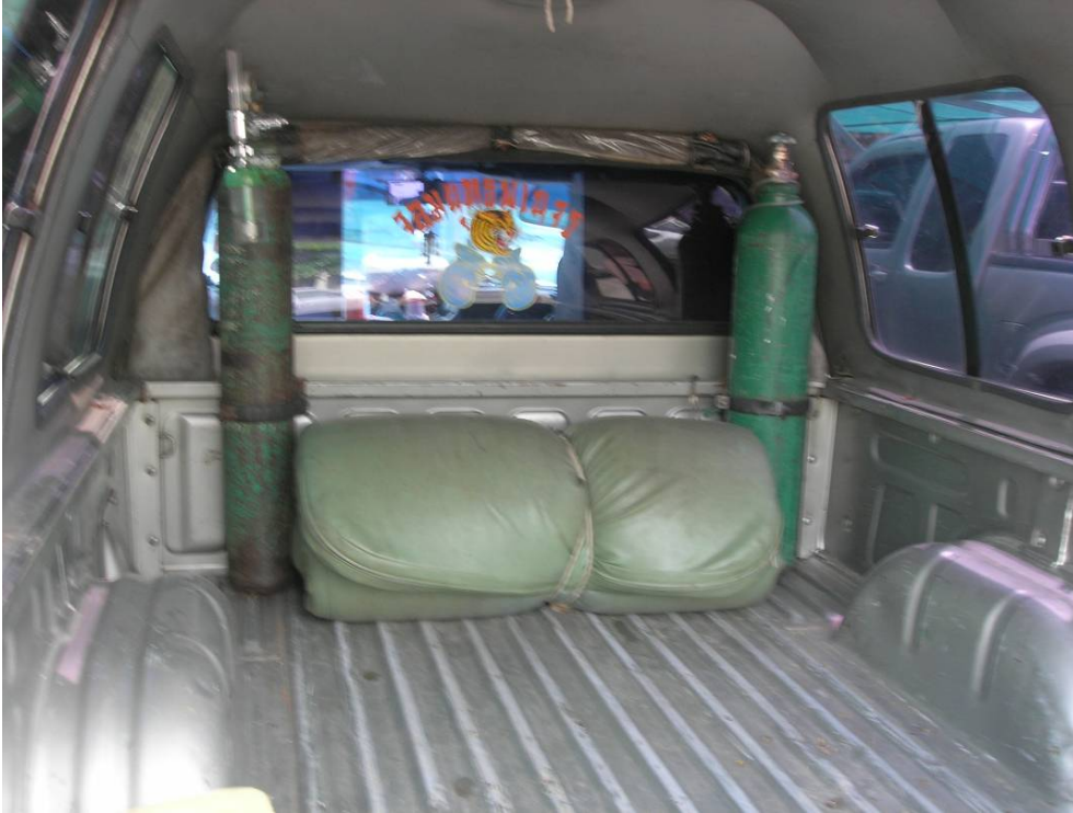
Figure 2. The guard's pickup ambulance with oxygen tanks and mattress