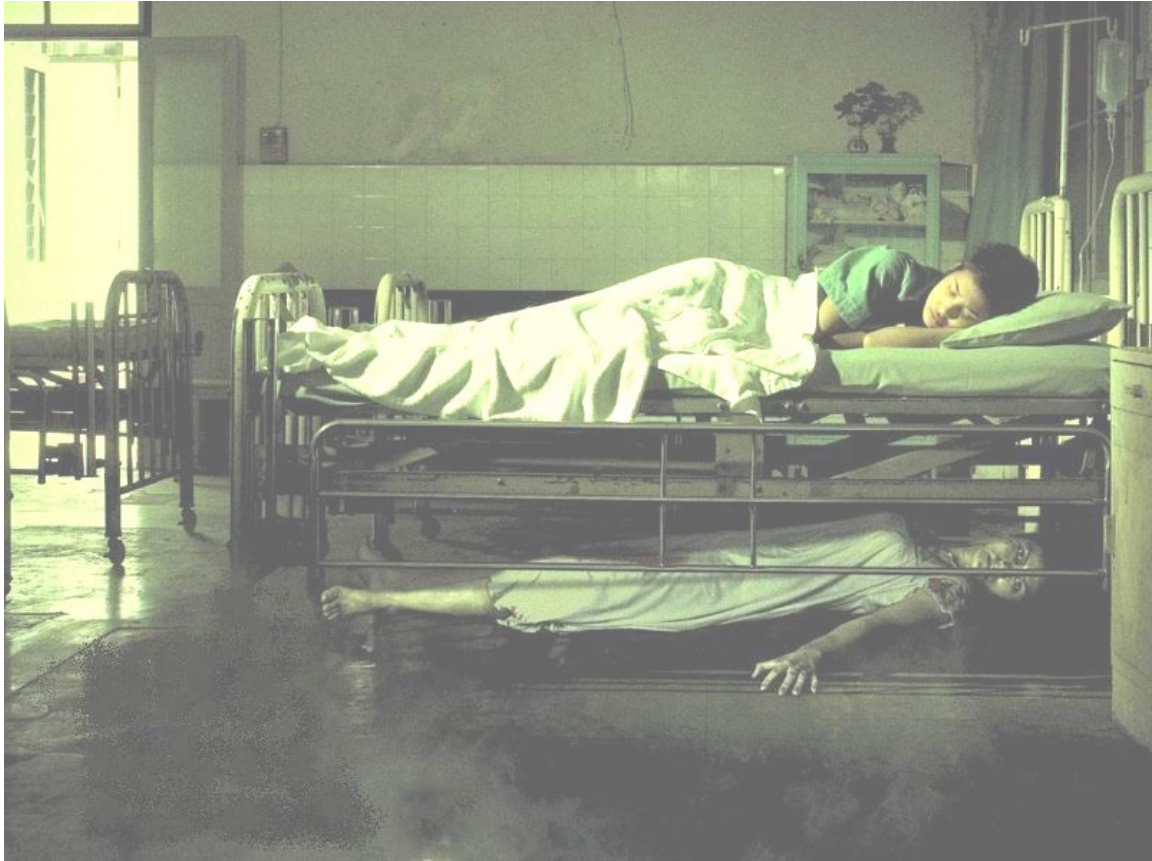
Figure 1. A medical student's proof of ghosts' affinity for hospitals.

My medical student friend smiled knowingly when I saw the photograph, as though it was proof of the existence of ghosts. He added that most photos of ghosts are in hospitals, because that is where ghosts are often closest at hand.