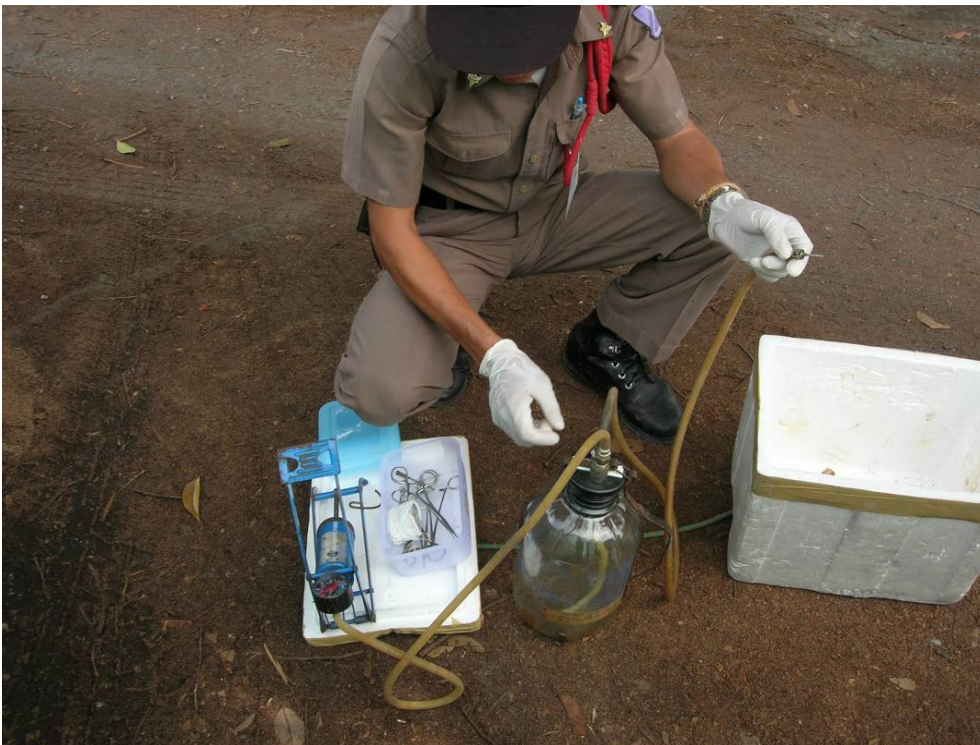
Figure 3. The guard's vein cut-down kit and improvised motorcycle tire pump embalming apparatus with attached large-bore needle.