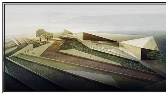
THE PALESTINIAN MUSEUM BUILDING

funded, official efforts by the PNA to shape a narrative around the Nakba and pass on its memory to future generations. Part of this effort, which is now in its construction phase, is to create a natural space that is integrated with the environment surrounding the facilities. The museum’s projected layout shows the importance of the land to the Palestinian narrative, with open windows celebrating the view of Ramallah (Figure 3), 54 an emphasis on endemic plant life, and an outlook on the Mediterranean (Figure 4) 55 —a tacit allusion to the right of return, as residents of the West Bank from villages near the coast can no longer access the sea without Israeli permits. However, similar to the case of Yad Vashem, this memorial fails to recognize validity of the Other’s claim to the area, refusing to use the word “Israel” in some of its descriptions. For instance, in speaking about partnering with other memorial institutions, cities/regions like Jaffa, Haifa, Nazareth, Acre, Shefaram, Sakhnin, Rama, Kufr Yassif, and the Negev are said to be in “1948 Areas” rather than within Israel proper. Neither Yad Vashem nor the Palestinian Museum seem ready to take steps to recognize the mere presence of the Other, let alone to formally acknowledge the other side’s narrative.