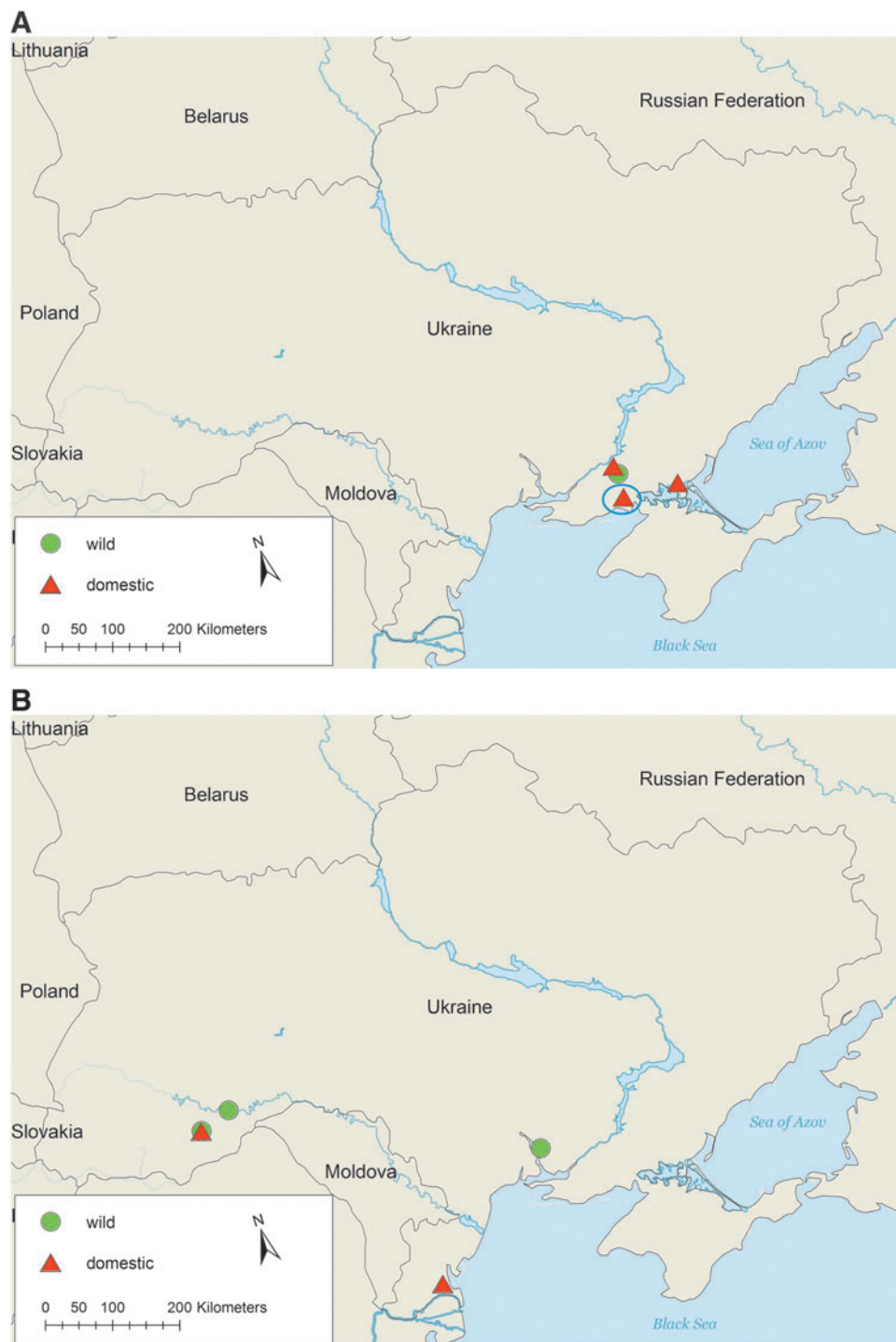
FIG. 1. (A) HPAI H5N8 cases in wild and domestic birds in Ukraine, November–December 2016. Locations of wild bird (green circle) and domestic poultry (red triangle) HPAI outbreaks. The first reported outbreak in domestic poultry in Novooleksandrivka village, Kalanchatskiy district (Kherson oblast), is marked (blue circle). Three HPAIV from this outbreak were sequenced. (B) Continuation of HPAI H5N8 outbreaks in wild and domestic birds in Ukraine, January–February 2017. Locations of wild bird (green circle) and domestic poultry (red triangle) HPAI outbreaks. HPAI, highly pathogenic avian influenza; HPAIV, highly pathogenic avian influenza viruses. Color images are available online.