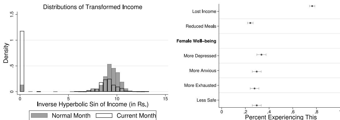
Fig. 1. Impact of aggregate shock on income and female well-being. Notes: The left sub-figure reports the distribution of the inverse hyperbolic sine of the household head's self-reported income in the current month and a normal month in rupees. The right sub-figure reports the percentage of households reporting reduced income, reduced meals, and worsening measures of female well-being. 'Lost Income' is the percentage of households where the head reported less income in the current month than a normal month. 'Reduced Meals' is the percentage of households where the head reported reducing the number/size of meals for at least one person in the household. The outcomes for female well-being (e.g., more depressed) were elicited by asking, "Have these feelings become worse now compared to before the COVID-19 crisis?" The figure reports the percentage of households with women reporting worse well-being.

that worsening does not simply reflect idiosyncratic changes or mean reversion.