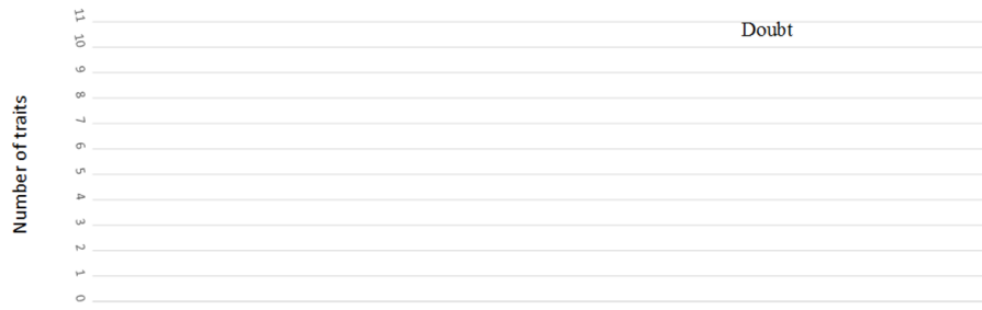
Figure 2. Number of DSM-IV personality disorder traits, by doubt severity. Obsessive-compulsive ( F_{4;1177} = 17.2, p < 0.001 ); Dependent ( F_{4;1177} = 22.5, p < 0.001 ); Avoidant ( F_{4;1177} = 9.6, p < 0.001 ).