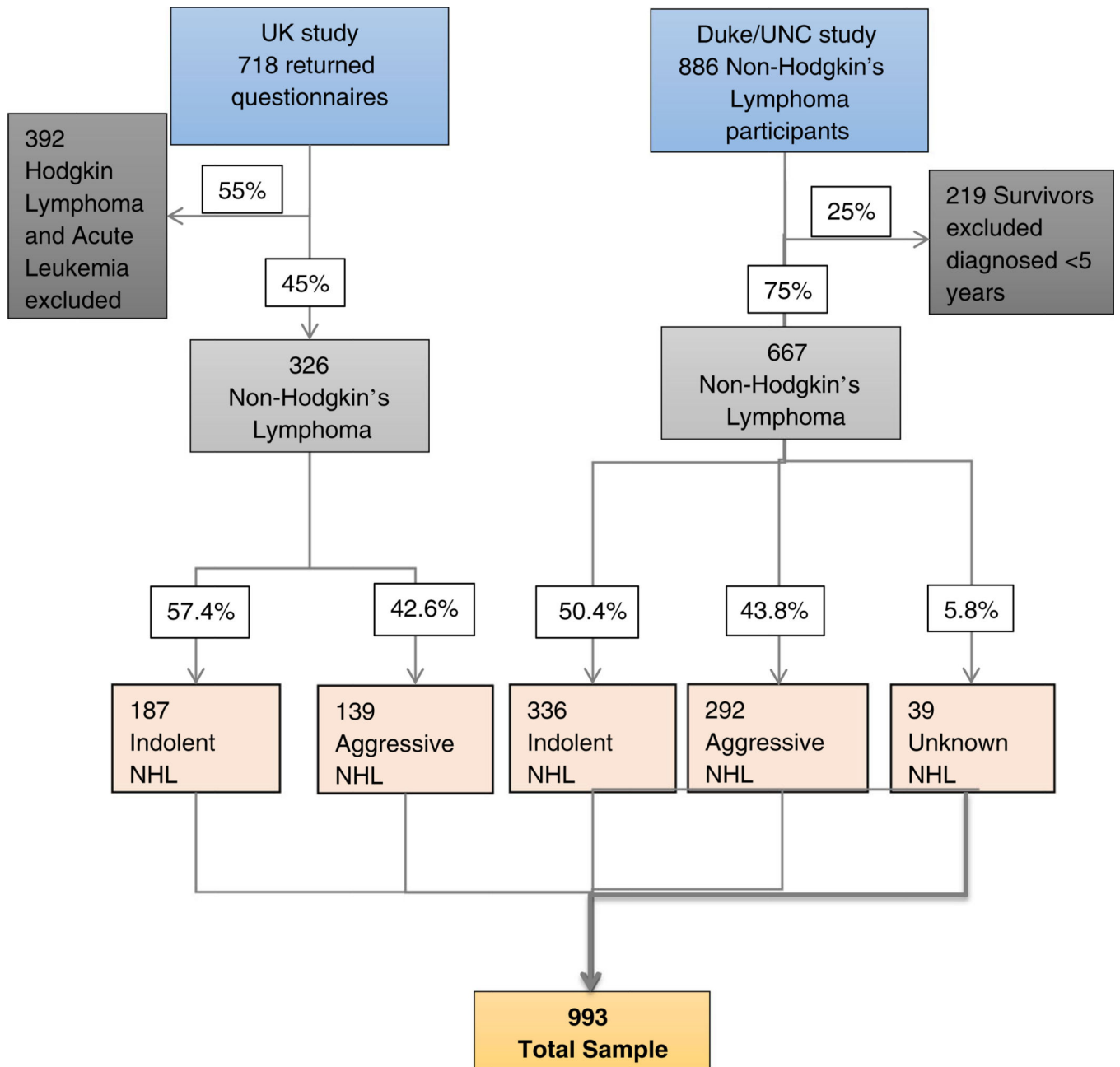
Fig. 1. Flow diagram of the study data structure