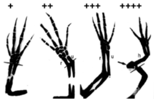
Figure 2. Disproportionate limb regeneration in newts with increasing doses of retinoic acid.

We have traced the entry of vitamin A into the body, but where does it come from in the first place? As a fully formed vitamin, it is only found in foods of animal origin, especially liver, milk, and eggs. However, vegetables such as carrots and leafy greens, such as spinach, kale, and collard greens, have compounds called carotenoids,