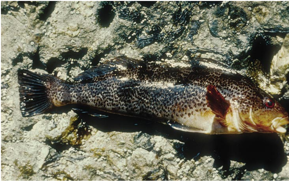
Sea Grant advisors provided technical assistance and training to regulators on the peer-review provisions of the Marine Life Management Act of 1998. Under the state law, the kelp greenling, above , is managed under a complex fishery-management plan developed for near-shore fishery resources, which was implemented in the 2002-2003 season.