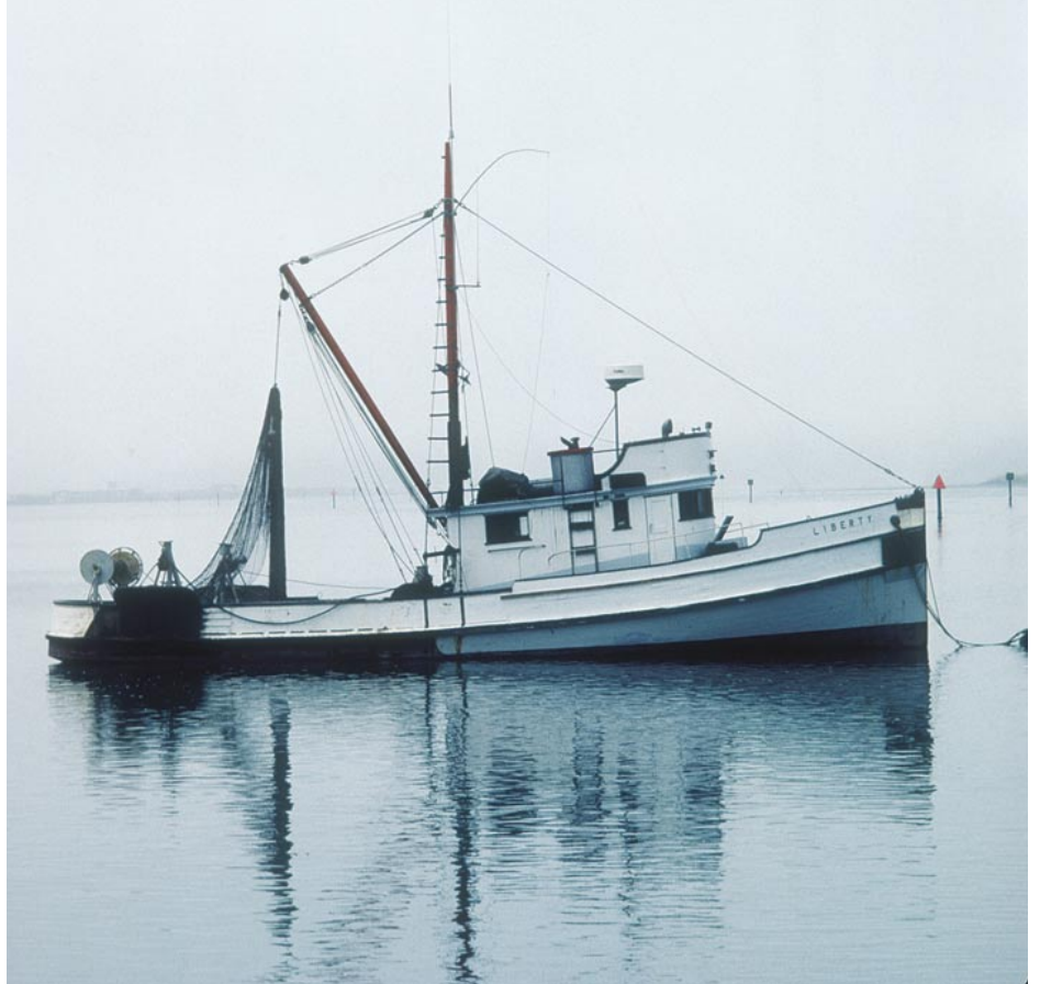
With some Pacific fisheries in decline, marine management issues are often contentious. In Bodega Bay, an old trawler rests on its mooring.

Marine fisheries nationally and in California have a long history of producing significant commercial and recreational benefits. Commercial fishing is the last significant industry where participants hunt and harvest wild organisms. Fisheries resources