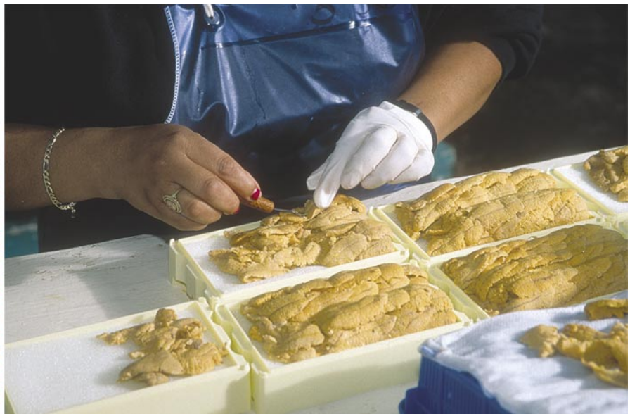
Because the California sea urchin industry was willing to work collaboratively with regulators and scientists, valuable monitoring data is being collected, which could inform a future fishery-management plan. Left , A sea urchin diver vessel in the Santa Barbara channel. Right , Sea urchin gonads are packed for shipment to Japan in a San Diego processing plant.