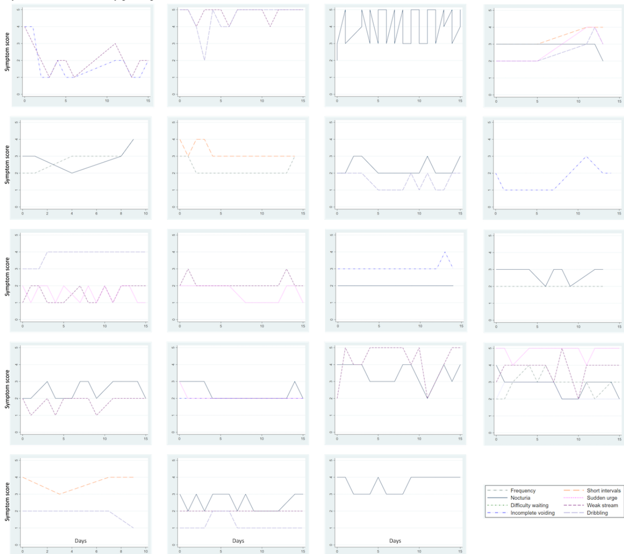
Figure 3. Change in urinary symptom severity over time for 19 study participants. Each panel in this figure visualizes the change in urinary symptom severity for an individual study participant.