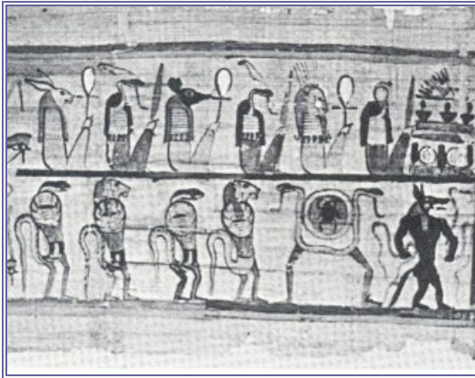
Figure 3. Guardian demons from a Guide of the Netherworld