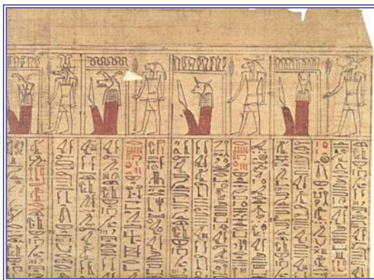
Figure 2. Guardian demons of Spell 145 of the Book of the Dead .

sense, they can be considered the Egyptian equivalent of the Medieval incubi and succubi , although the characterization of sexual assault associated with the latter is not explicit in the Egyptian spells. Depictions of these roaming spirits are nonexistent except for the sketch of the headache demon Sehaqeq mentioned above (fig. 1). Occasionally, spells allude to their evil glance and warn them to turn their face backwards.