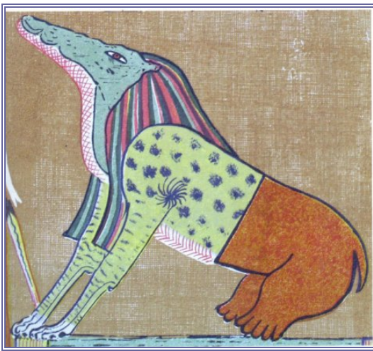
Figure 4. Ammut, “the devourer of the dead”, from Spell 125 of the Book of the Dead .

Egyptological interpretation of demons as minor deities derives from these protective figures, which are often depicted with an animal head on an anthropomorphic or mummified body and holding knives or other weapons in their hands.