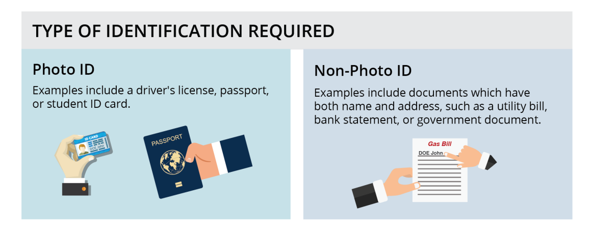
Figure 2. Types of Identification Required and Strictness of Voter ID Laws<sup>13</sup>

In addition to voter registration requirements, state-level voter ID laws in the United States date back to 1950, when South Carolina became the first state to request that voters present a document bearing their name at the polls. 12 Since HAVA was enacted in 2002, an increasing number of states have adopted stricter voter ID requirements that require all voters to provide proof of their identity to poll workers in order to vote on a regular ballot. Currently, 35 states have voter ID laws that will be in effect for the November 2020 general election. These voter ID laws can be categorized based upon the options available for voters who do not have the required identification (their "strictness"), and whether the identification is required to include a photo (see Figure 2).