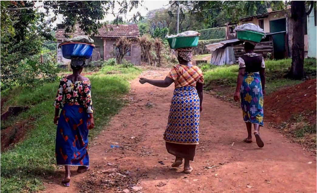
Figure 2. Women walking in the Mwanza region, Tanzania. We estimate that approximately one third of adolescent girls and young women marry under 18 years in the study area, meeting the definition of ‘child marriage’.

population with urbanisation, now matching or even exceeding boys’ education (Hedges et al. 2018). While schooling reduces farm and household work, this is truer for boys; girls who attend school still contribute substantially to domestic chores, effectively taking on a ‘double shift’ of school and domestic work, reducing their time allocation to leisure (Hedges et al. 2018).