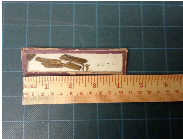
Fig. 1. Dante's coffin fragments.