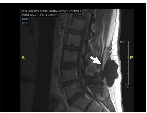
Image 2. Sagittal T1-weighted magnetic resonance imaging of the lumbosacral spine demonstrating the pseudomeningocele (arrow) identified initially on ultrasound.