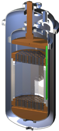
Figure 1: A cross section rendering of the LUX detector.

The ionization signal (“S2”) is read out with electroluminescent light in the gas region with the top PMT array.