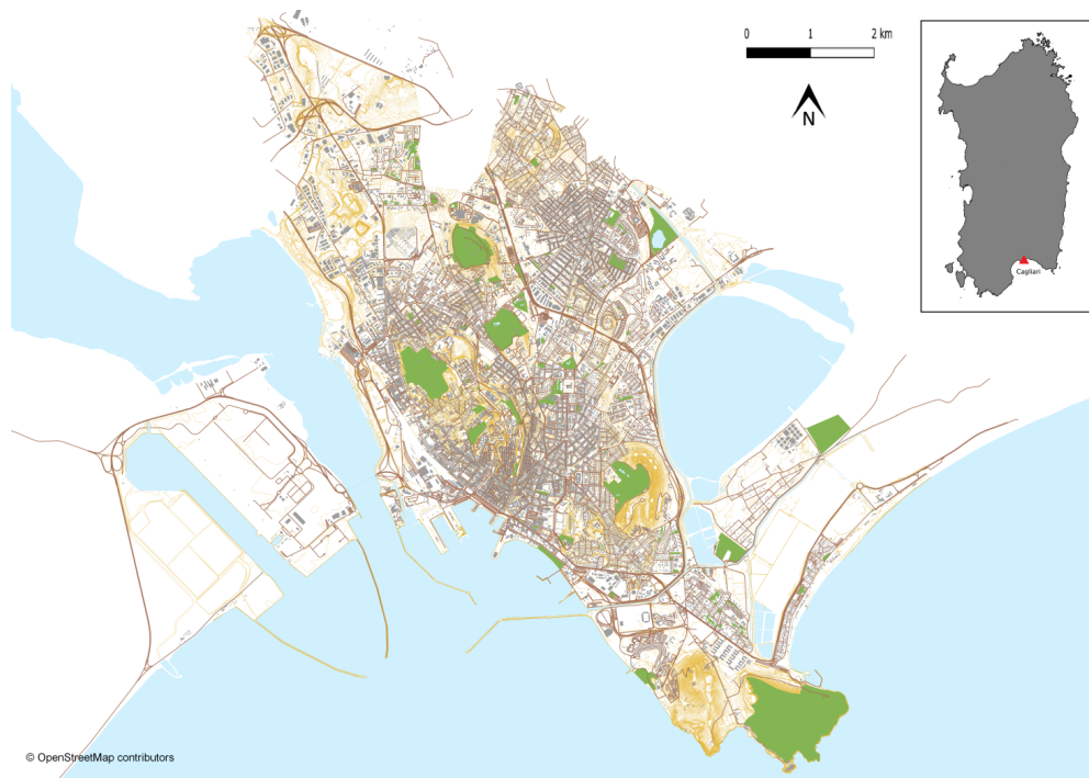
Figure 1. Map of the research area and its location in Sardinia.

This study was performed in Cagliari, Sardinia, Italy (WGS84 coordinates: 39.2236, 9.1181) (Figure 1). The city is located in the southern part of the island of Sardinia in the middle of the Golfo degli Angeli. The territory has a thermo-