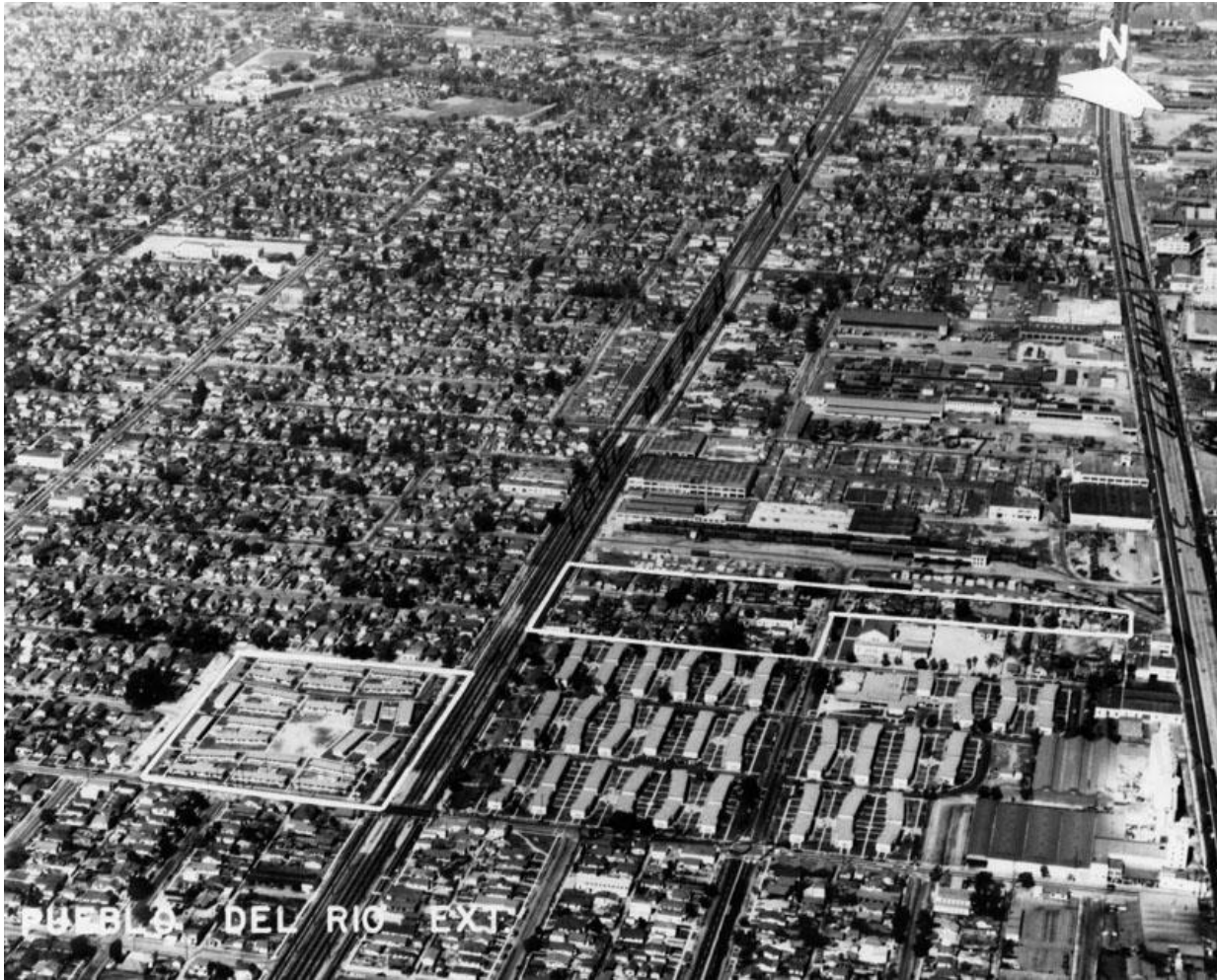
Figure 4. Aerial view of Pueblo Del Rio. 133

The construction of Pueblo del Rio centered on ideas of collectivity and recreation. The overall gridiron layout was influenced by the existing main thoroughways. Within this layout, the architects designed the project with families well in mind. The buildings are clustered in four groups creating a rectangle and repeat continuously. The spaces between are filled with concrete walkways and grass-filled lawns. Each apartment has its own small garden plot for families to plant flowers. The ample spacing of the buildings allows for light and air circulation for each