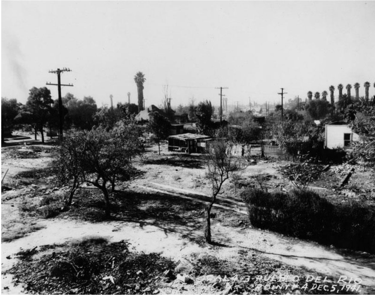
Figure 3. View of the area where Pueblo Del Rio was built. Location is between East 53 rd and 55 th Streets near Fortuna Street. 132