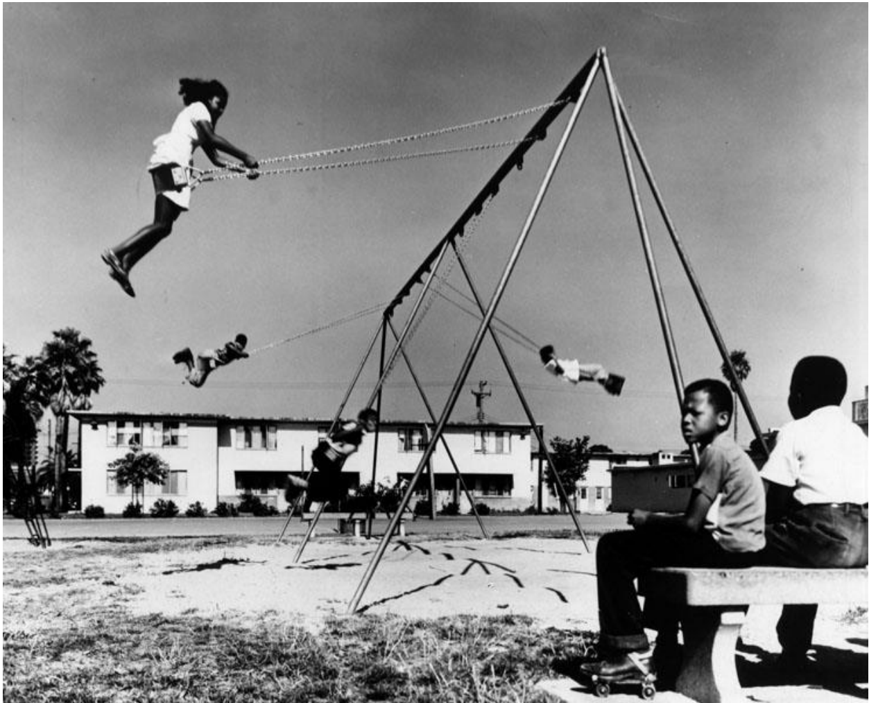
Figure 5. Children at play in Pueblo del Rio playground. 136

play area for older children. 135 The project's design intersects at the juncture of several material and social concerns that manifest in a civilly-minded modernist way: human need and dignity; pragmatic material constraints; the relationship between the former and the later; and the utilization of modern technology to transform these concerns into a socially conscious housing area of solution in an the city that was struggling to fight for decent housing in the 1940s.