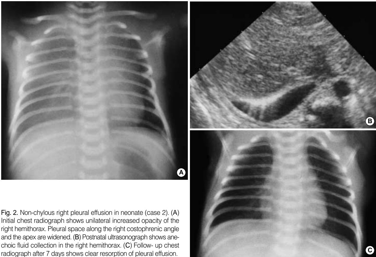
Fig. 2. Non-chylous right pleural effusion in neonate (case 2). (A) Initial chest radiograph shows unilateral increased opacity of the right hemithorax. Pleural space along the right costophrenic angle and the apex are widened. (B) Postnatal ultrasonograph shows anechoic fluid collection in the right hemithorax. (C) Follow-up chest radiograph after 7 days shows clear resorption of pleural effusion.