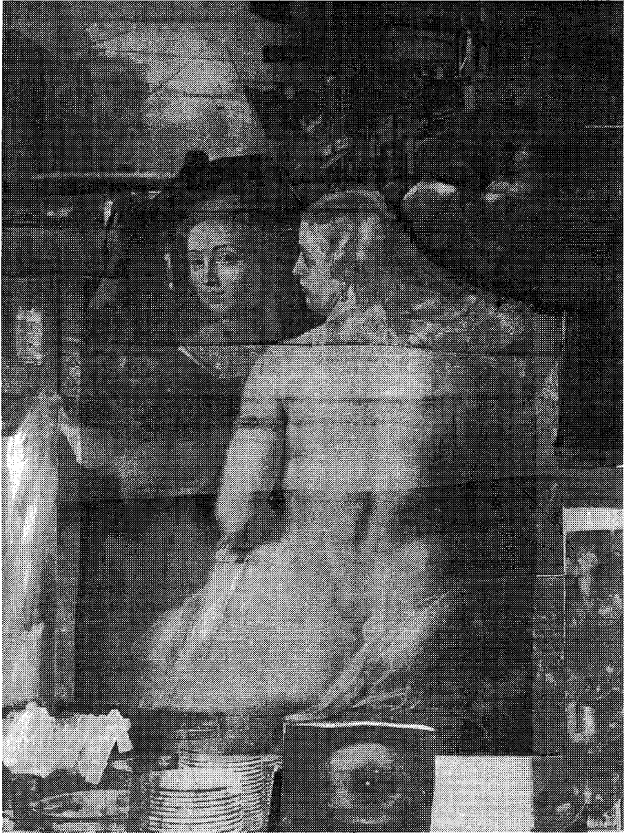
Robert Rauschenberg, Persimmon.