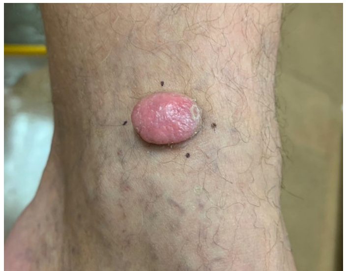
Figure 1. A 1.8 cm exophytic pink plaque on the left medial ankle.

Lipidized fibrous histiocytoma is a rare, and underrecognized form of dermatofibroma (fibrous histiocytoma) that presents as a solitary, slow-growing exophytic tumor, that favors the lower