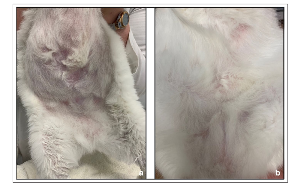
Figure 3 (a) Ventral abdomen and inguinal region after 6 weeks of antimicrobial therapy. (b) Ventral abdomen and inguinal region after 16 weeks of antimicrobial therapy

Treatment of NTM infections typically requires several months of antimicrobial therapy,<sup>18,20</sup> with resolution