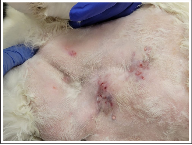
Figure 2 Inguinal region of a cat infected with Mycobacterium porcinum on initial examination at the referring hospital. Multifocal ulcerative cutaneous lesions are present