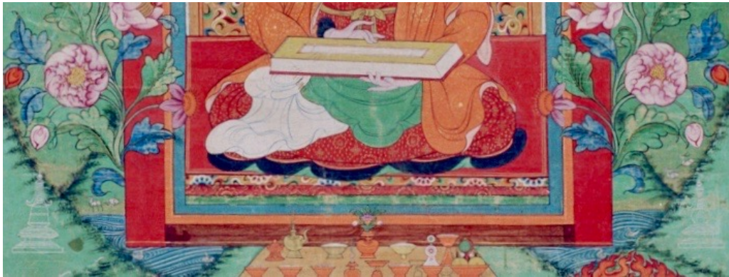
Figure 14. Detail of Zanabazar's portrait showing two stupas, thangka , ca. 1723.

Lvsanprinlei opens his biography of his teacher Zanabazar with a list of his ancestors from the Golden Lineage. Yet this list is soon abandoned in the later hagiographies, with the aim of focusing on Zanabazar's Géluk affiliation and his relationships with the Géluk Dalai and Panchen Lamas. Subsequently, these key figures of Géluk power are depicted in the only portrait of him that was made around the time of his death, a date evidenced by the small white sketches of two small stupas on either side of Zanabazar near the bottom of his portrait (figures 1 and 14). These stupas are identified as a Parinirvāṇa stupa (Tib. myang 'das mchod rten ) (left), and an Enlightenment stupa (Tib. byang chub mchod rten ) (right). 23