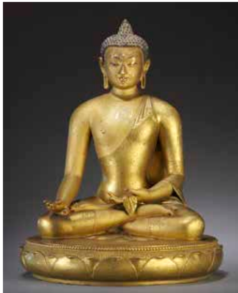
Figure 16 (left). Zanabazar, Buddha, gilt bronze, late seventeenth century.

alludes to their relationship to the Third Dalai Lama and to Abatai Khan, thus claiming direct connections to both the Géluk and the Mongol hereditary imperial pedigree (Pozdneev 1880, 33). 24 It is, however, only in Zanabazar's portrait that both the Dalai Lama and the Panchen Lama are depicted together presiding over the new reincarnate ruler in Khalkha Mongolia, recalling both lamas' endorsement of his reincarnation early in his childhood. The painting follows the textual sources and is another piece of evidence demonstrating that the Géluk dominion was gradually and deliberately built up in Khalkha Mongolia in concert with the Jebtsundampa lineage.