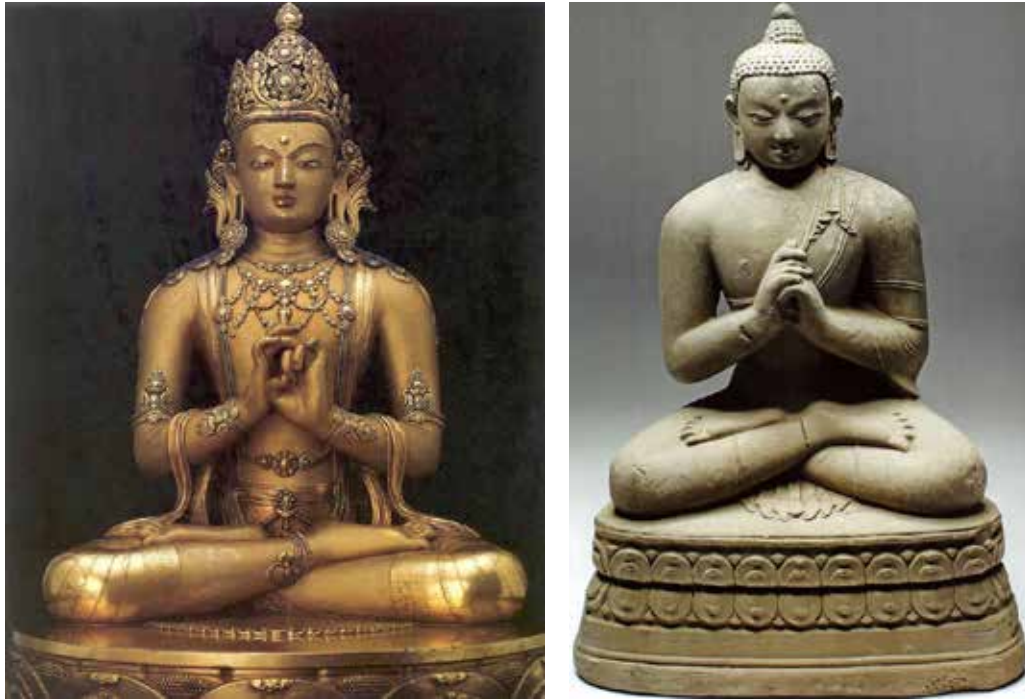
Figure 8 (left). Vairocana, from the set of Five Buddhas, gilt bronze, ca. 1683. Source: Tsultem (1982a, pl. 16). Courtesy of the Zanabazar Museum of Fine Arts, Ulaanbaatar.