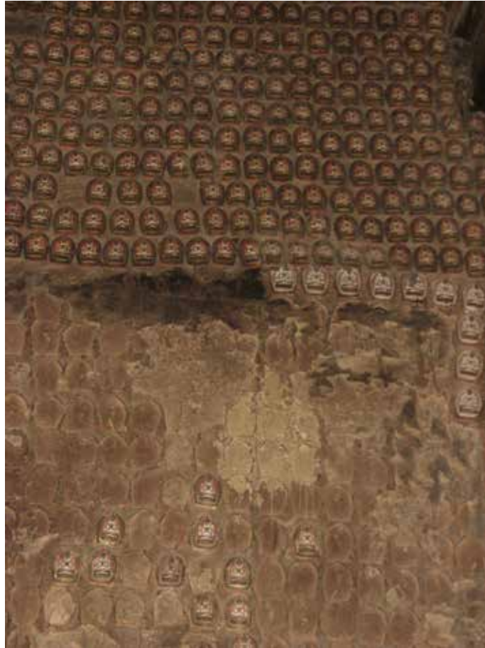
Figure 13. Wall in Shalu Monastery, Central Tibet, fourteenth c.

The quantity of these clay Buddhas, and the fact that they were meant to be seen only frontally—the backs are plain and lack any ornamentation, unlike their counterpart bronzes—suggest the possibility that they also occupied entire walls surrounding the monumental Buddhas in the center (which might also have been the Five Buddhas). Or, as later nineteenth-century productions at Ikh Khüree suggest, these statues may have been placed along the back walls behind the main image.