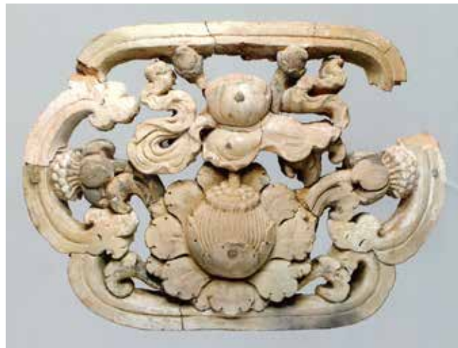
Figure 5. One of eight auspicious symbols, clay, Saridag Monastery, 1654–1689.

There were several of these colossal Buddhas, with hands and feet measuring 130 and 120 centimeters, respectively. The statues originally stood on large lotus thrones along the walls at a distance of about 30 to 50 centimeters apart. The main assembly hall also had other equally monumental and most likely seated sculptural images of the Buddha. One remaining piece of a thigh from a large Buddha statue measured 1.4 meters in height and 80 centimeters in diameter. The lotus pedestal where it was positioned is 2.6 meters in diameter. Offerings to the deity—including grains, walnuts, fruits with large seeds, yellow grain, as well as the eight auspicious symbols were also found (figure 5).