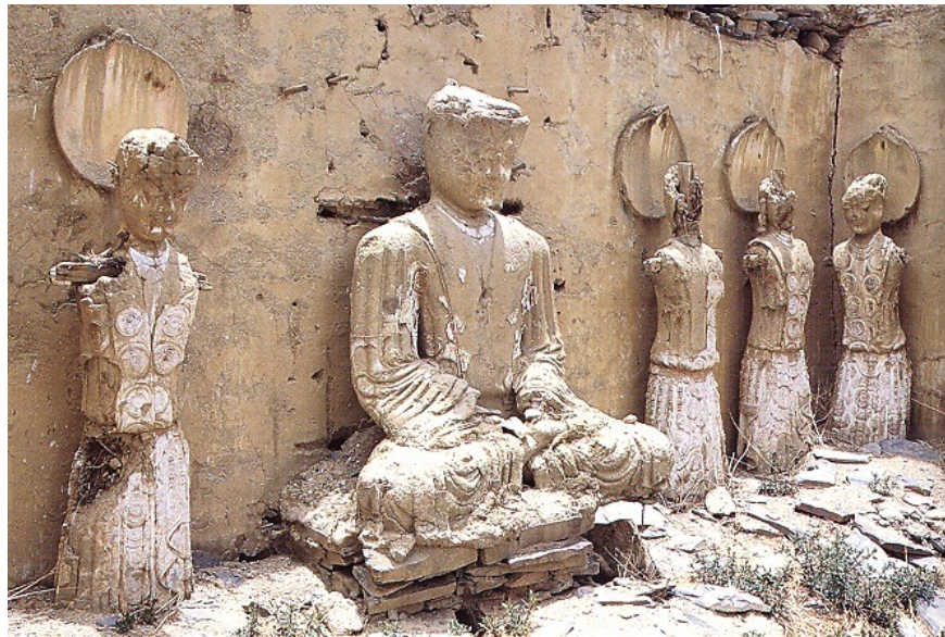
Figure 12. Remains of Buddha and bodhisattva statues, Yemar, Central Tibet, eleventh century.

vanivāraṇa-viṣkambhin—typically accompany a central Buddha, as is seen in early thangkas and at such sites such as the eleventh-century Kyangbu (Tib. rKyang bu ) and Yemar (Ye dmar) (figure 12) in Central Tibet. 22 The central Buddha in these compositions is usually marked by his large size and accompanied by four bodhisattvas on either side. As broken parts of monumental Buddhas have also been discovered at Saridag, though they are as yet unidentified and currently impossible to reconstruct, the presence of compositions reminiscent of early sites at Ü-Tsang, with large Buddhas flanked by the Eight Mahābodhisattvas, is not only plausible but highly likely.