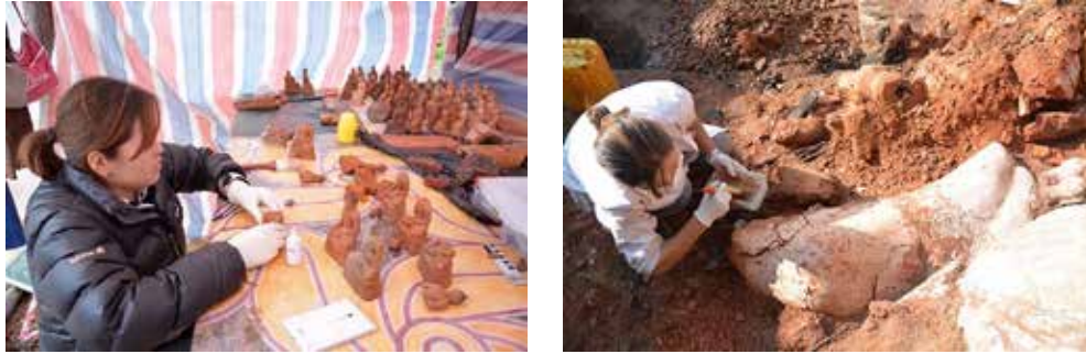
Figure 3 (left). Fragments of Buddha statues, clay, Saridag Monastery, 1654–1689.