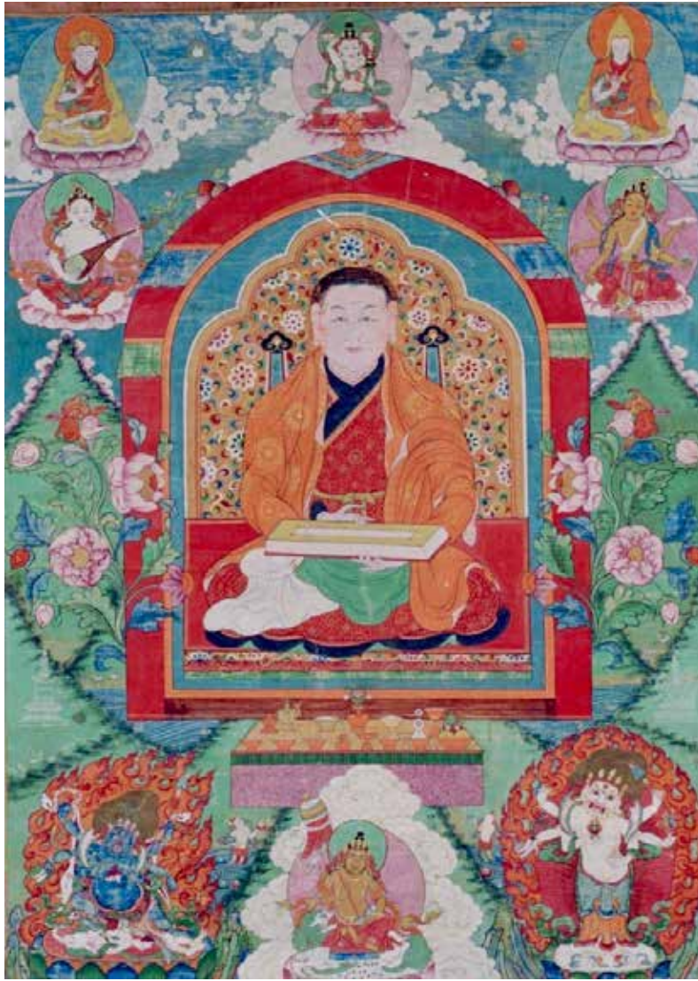
Figure 1. Portrait of Zanabazar, mineral pigments on cotton, ca. 1723.

in Zanabazar's portrait in the bottom register, where he appears together with the six-armed Mahākāla particularly favored by the Géluk order. In the center, next to the two forms of Mahākāla, stands the Guardian of the North, Jambhala, 3 alluding to the northern location of Mongolia relative to Tibet as well as Zanabazar's own practice inclusive of the wealth deities.