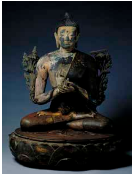
Figure 17 (right). Zanabazar, Mañjuśrī Buddha, gilt bronze, seventeenth century.

Both textual and visual materials, especially those from current archeological findings, suggest that Zanabazar recalled the renowned Tibetan reformer Tsongkhapa in his open attitude to practices and doctrines regardless of sectarian boundaries. With his hereditary imperial pedigree, Zanabazar's authority for rulership was secured, and thus Galdan's fight against Zanabazar cannot be seen only as a power struggle between the Khalkha and the Dzungar Mongols. Zanabazar's ability to build up his dharma seat Ri-