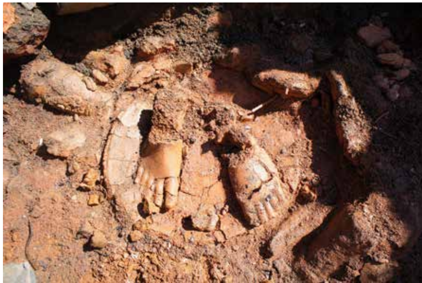
Figure 11. Feet of bodhisattva statues, clay, Saridag Monastery, 1654–1689.

In other words, the clay statues suggest Zanabazar's advocacy of the earlier non-sectarian forms that he had seen in Ü-Tsang (Central Tibet). My earlier hypothesis in 2009 that Zanabazar's aims were to establish collective practices of dharma that were common to all Buddhist lineages seems further supported by the evidence of this truly massive production of the Five Tathāgatas at the first dharma seat he established in 1654–1688 (Uranchimeg 2009, 2016, forthcoming).