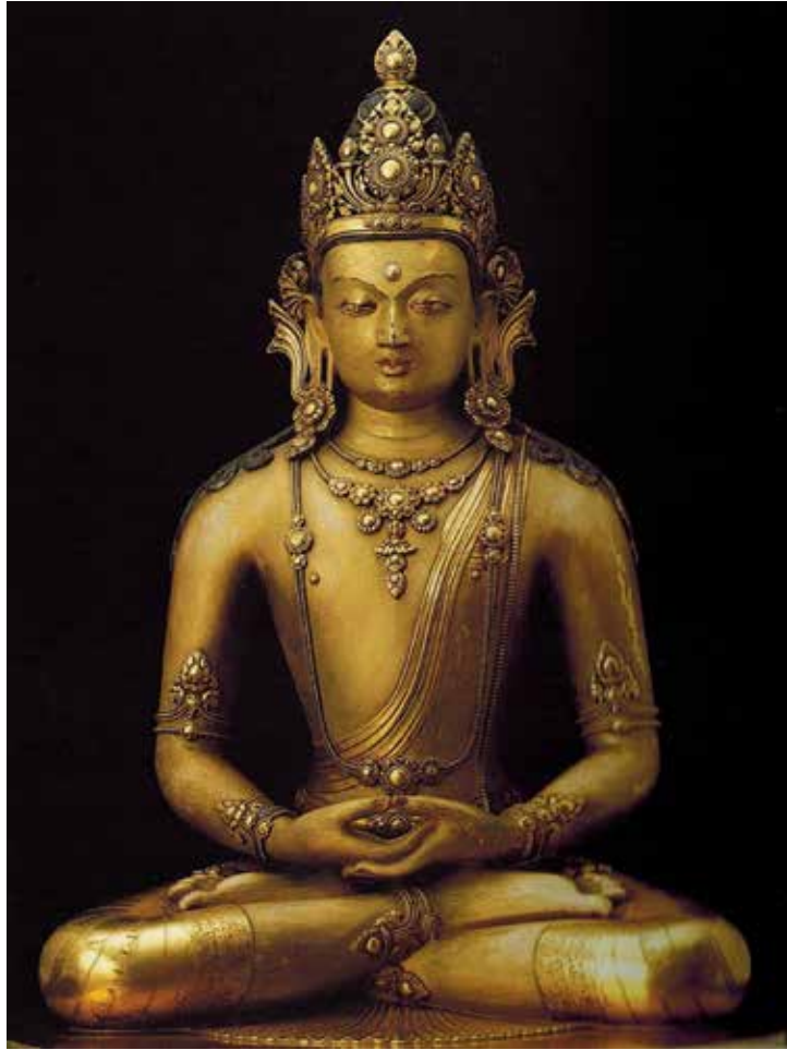
Figure 7. Amitabha, from the set of Five Buddhas, gilt bronze, ca. 1683.

The same set, made in the form of large gilt bronzes, are significantly different and more sophisticated in style, decor, and modeling than the clay Buddhas. In the gilt-bronze set of the Five Tathāgatas, Vairocana (figure 8) is visually distinct, with a larger body and enhanced ornamentation that takes up a major part of his upper torso. These gilt bronzes of the Five Tathāgatas, White Tārā, and Amitāyus, and the set of Vajradhāra and Vajrasattva—all of which exhibit a similar style and high level of quality in their fabrication—are also believed to have been made at Saridag Monastery (Uranchimeg 2010, 2013, 2015, 2016). 20