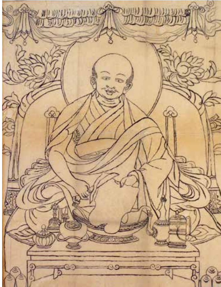
Figure 15. Zanabazar's Mongol portrait, woodblock print, eighteenth century.

of knowledge in his right hand, akin to Mañjuśrī, and holding fat from a sheep's tail in his left hand, in keeping with an old Mongolian head-of-household tradition (Ichinnorov 1998, 49–50). According to this tradition, it is only the male head of the household who slices a sheep's tail for his family.