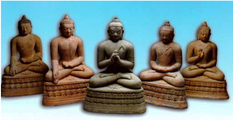
Figure 6. The Five Buddhas, clay, Saridag Monastery, 1654–1689.

The most important findings in this complex are approximately three thousand clay Buddha statues of the Five Tathāgatas (figure 6) that are all similar in style, construction, and size. All of these statues represent the Five Buddhas with Vajradhātu Vairocana. The set of clay sculptures of the Five Tathāgatas was likely produced using a single mold, as the features of the statues are identical in size, shape, and detail. Their style and iconography do not represent any specific sectarian connections, and they do not follow seventeenth-century Géluk-favored models.