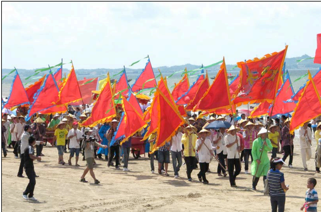
Figure 4. Communal house singing festival procession in Wanwei, 2011.