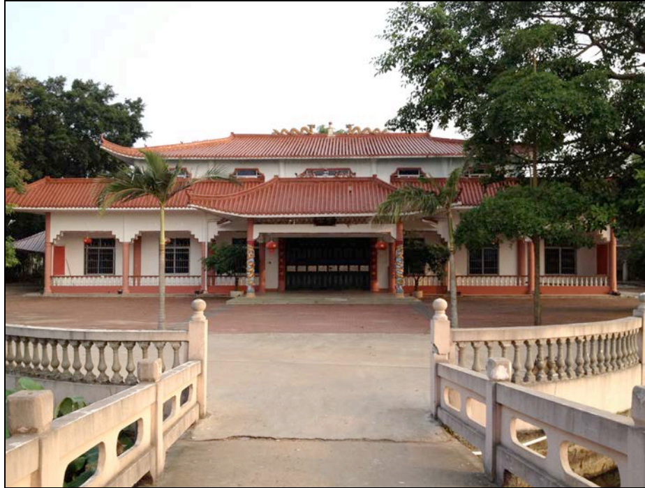
Figure 3. Restored communal house in Wanwei, 2008.

Jing people have a rich repertoire of songs. In addition to ceremonies held in the communal house, they sing at weddings, in which songs are the main mode of interaction; they sing stories and recite poetry. 7 Jing boys and girls also sing call-and-response songs while working by the seashore or during leisure time on the weekends (see Cheung 2011). The Hát đình (communal house singing) festival has become such a popular tourist attraction that it has been moved from the communal house to the seashore (see figures 4 and 5). But most of these cultural activities are reserved for the descendants of the original settlers, and therefore the Vietnamese wives, as new immigrants, may not participate in them except as spectators.