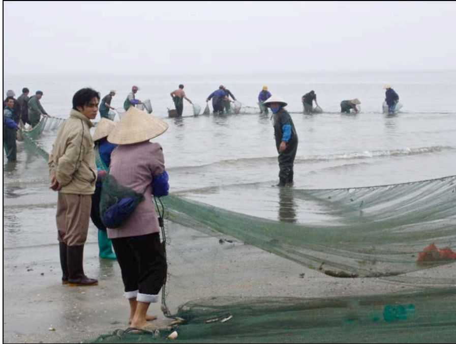
Figure 2. People in Jingdao hauling in fishing nets at the Wanwei seaside, 2006.