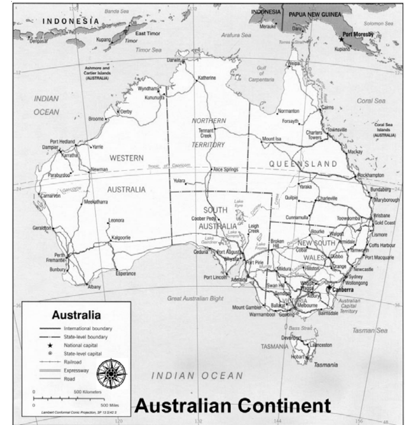
Figure 1. The States of Australia