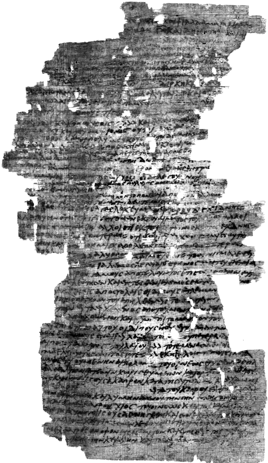
Plate 2: P.Würzb.Inv. 18 verso (B), Papyrussammlung der Universitätsbibliothek Würzburg.