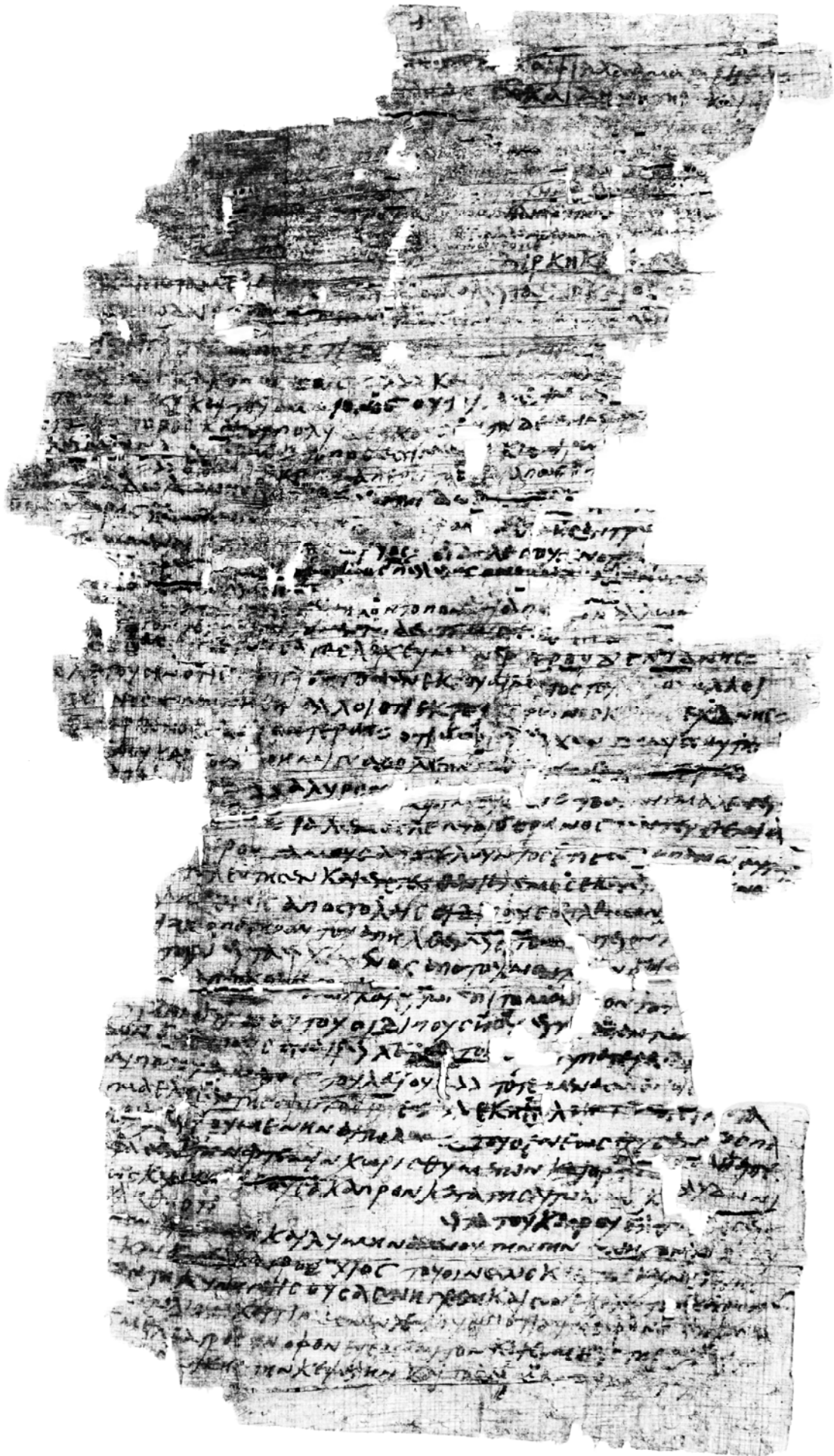
Plate 4: P.Würzb.Inv. 18 verso (H), Papyrussammlung der Universitätsbibliothek Würzburg.