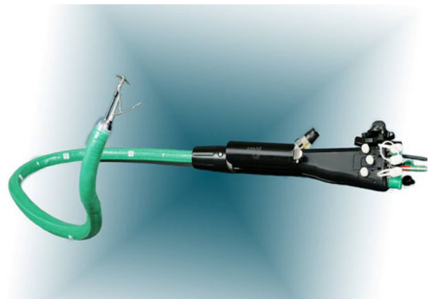
Fig. 1 The Incisionless Operating Platform (IOP) transport device