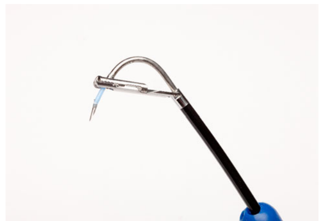
Fig. 3 g-Prox with needle deployed