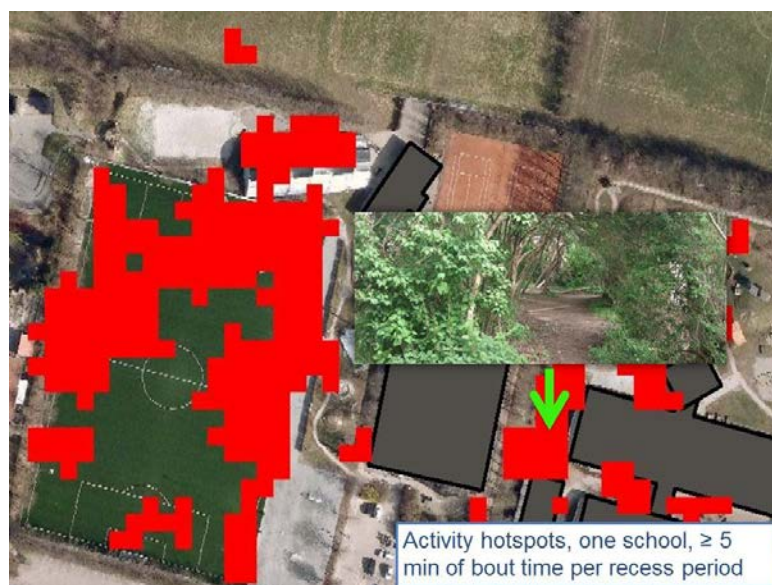
Figure 3. Physical activity hotspots of children from one schoolyard with an unexpected activity hot spot on school grounds – a vegetated trail.