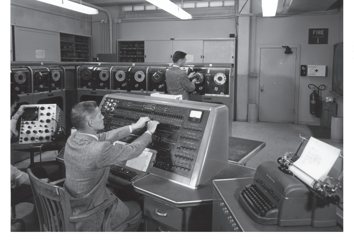
FIGURE 5. UNIVAC, one of the computers used in the analysis of strategic vulnerability.

infrastructures, food systems, and public utilities that met civilian needs.