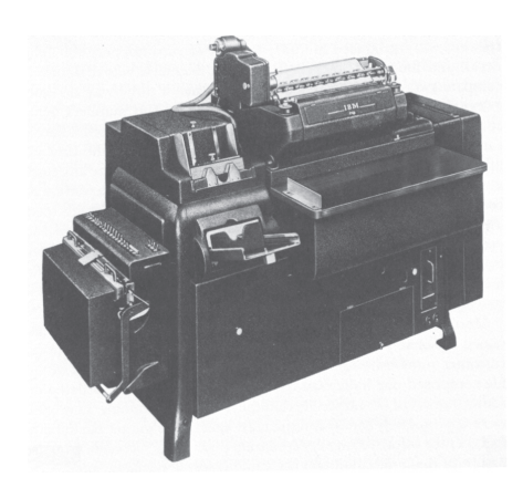
FIGURE 1. The IBM 405 Electric Punched Card Accounting Machine, a model in operation in the years immediately following World War II. In a typical application, the machine read a deck of punched cards, each of which contained a series of numeric fields. The machine then tabulated the totals for each field selected by an operator.

The methodology for strategic target selection employed in the SVB had been developed during World War II by economists serving in U.S. air intelligence units such as the Enemy Objectives Unit, which identified strategic targets in Germany, and the Joint Target Group, which focused on Japan. In deciding which systems to target, these economists analyzed the relationship of a given target system (such as oil or transportation) to the production of strategically important end products by examining the flow of inputs and outputs through an adversary's industrial production system. They could then assess this target system's vulnerability by looking at factors such as "cushion" (available reserves), "depth" (how long it would take for the destruction of a given target to affect military supply lines), and "substitutability" (whether a targeted item could readily be replaced by another product).