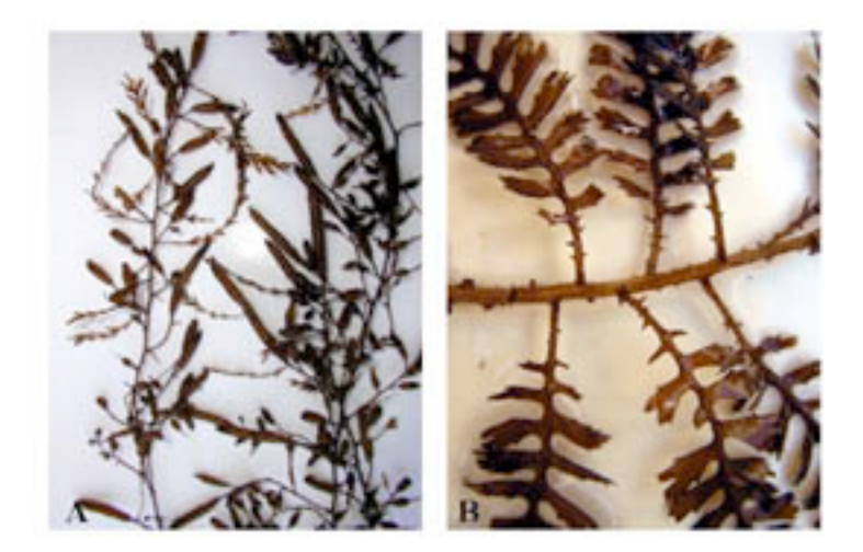
Figure 4b. Juvenile Sargassum filicinum from Santa Catalina. Island. Note spiny axes.