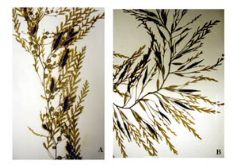
Figure 4a. Mature Sargassum filicinum with receptacles and elliptical vesicles from Santa Catalina Island.

Figure 3b. Sargassum horneri from Japan (University Herbarium, University of California at Berkeley). Note elongate vesicles and cigar-shaped receptacles.