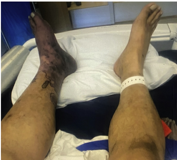
Fig 3. Affected leg compared with the right leg after mechanical thrombectomy.

external iliac vein. His left great and small saphenous veins were also occluded. His right popliteal, femoral, and common femoral veins were also thrombosed; however, his right leg remained asymptomatic. On physical examination, he continued to have audible Doppler signals over the dorsalis pedis artery and posterior tibial artery at the ankle. No evidence of left-sided arterial occlusion was present radiographically. Noninvasive imaging with arterial duplex ultrasonography revealed the presence of biphasic flow in the dorsalis pedis artery and posterior tibial artery in the left lower extremity. Also, an appropriately timed