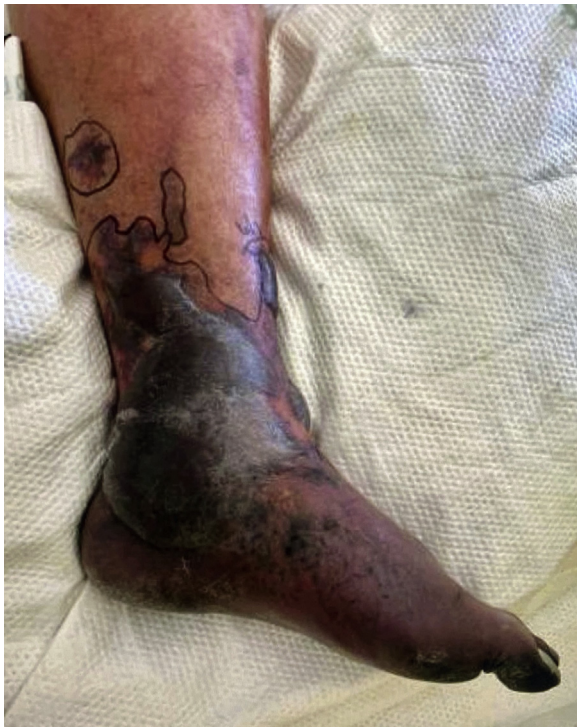
Fig 4. Progression to dry gangrene of the left foot despite restoration of deep venous patency.

The patient provided written signed consent for the report of the details and images from his case.