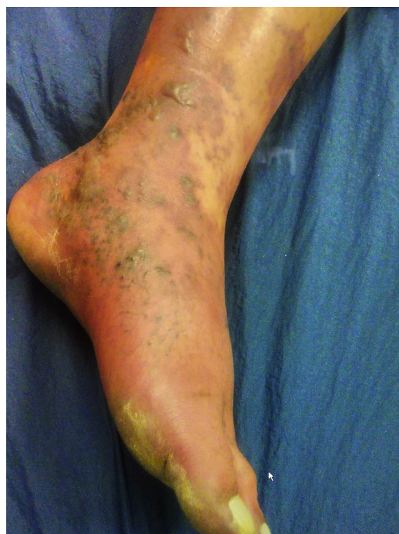
Fig 1. Venous outflow obstruction of the foot due to phlegmasia cerulea dolens before mechanical thrombectomy.

A 51-year-old man had presented to an outside hospital with a 2-day history of cough, fever, and shortness of breath and was admitted with a diagnosis of acute coronavirus disease 2019 (COVID-19) pneumonia. He progressed to acute hypoxic respiratory failure (80% oxygen saturation with 60% bilevel positive airway pressure) but refused intubation. His medical history included congenital tricuspid atresia and pulmonic stenosis that had been repaired with a Fontan procedure as a child. The patient had been receiving long-term warfarin secondary to recurrent paroxysmal atrial flutter. He had no history of deep vein thrombosis or a hypercoagulable condition. He was also noted to have moderate, constant pain, mostly in the foot but also up to the midshin and thigh, and calf edema, motor weakness, and discoloration in his left lower extremity. All leg and thigh muscle compartments were soft on physical examination (Fig 1). On presentation to an outside hospital, his international normalized ratio (INR) was found to be suprathreshold (7.5), and he received a dose of oral vitamin K and convalescent