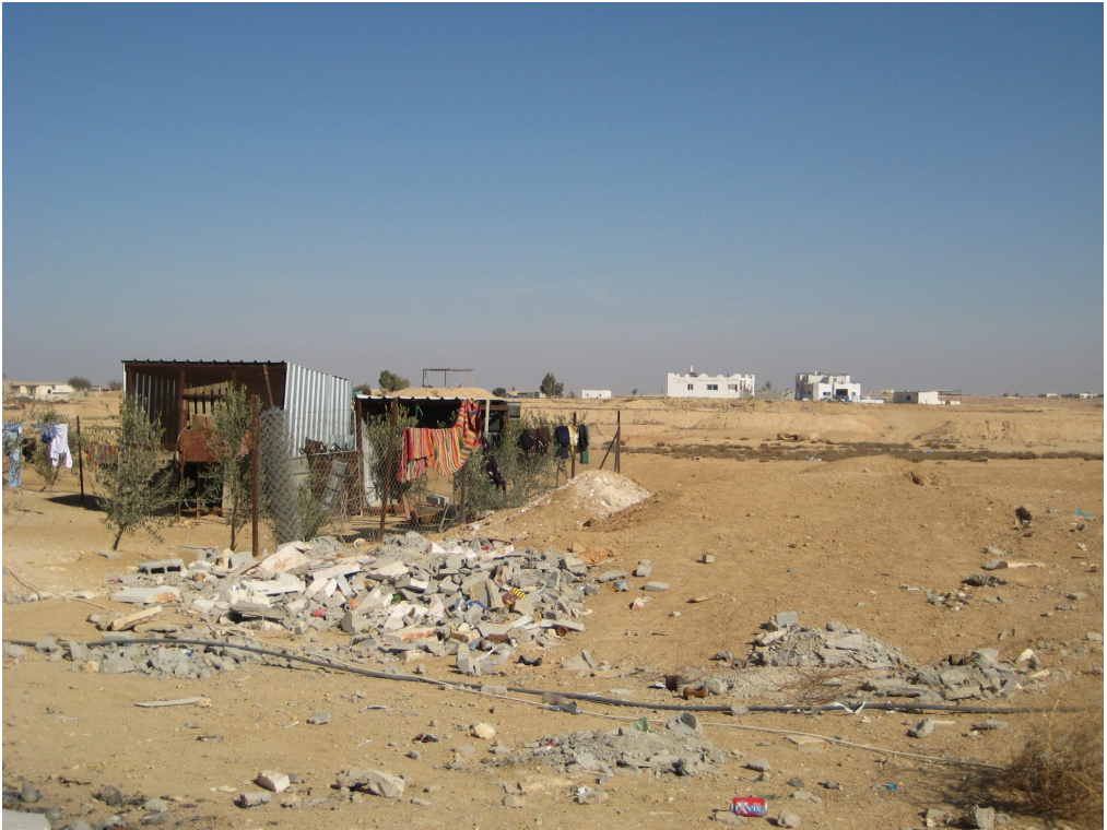
Figure 3 Abu-Krenat's Neighborhood 1 viewed from unrecognized development.