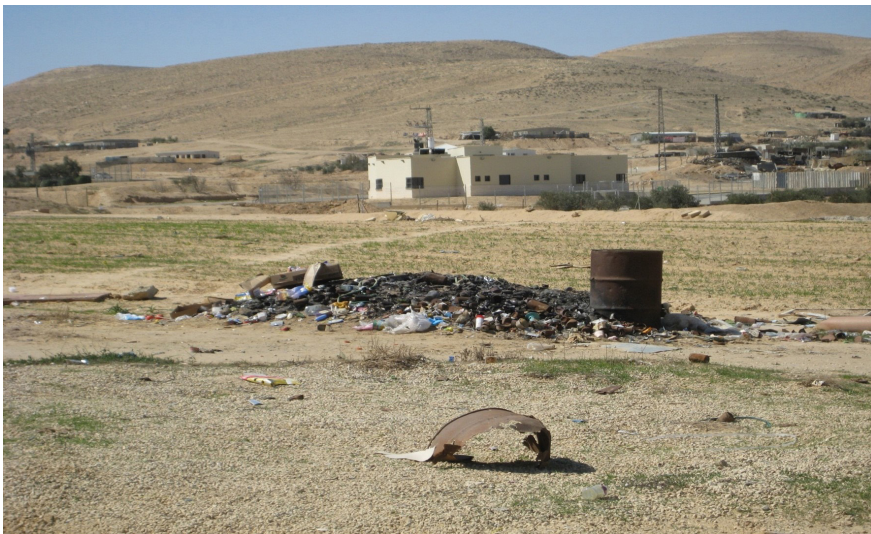
Figure 2 New public facility and existing neighborhood service, trash burning.

As of 2015, eight years after the approval of Kaser a-Ser's Neighborhoods 7 and 9 and nine years following the construction of a new school and clinic, no Kaser a-Ser resident had built a home in a planned neighborhood. These setbacks to neighborhood development indicated to some academics and ABRC planners that "Amram . . . was very smart in getting all the budgets to build the schools and so forth. He said, let's do what we can. Let's provide services, let's give them education, let's give them what they need" (Kaser a-Ser neighborhood planner 2011). A new public facility in Kaser a-Ser and an existing resident-provided solution to neighborhood service provision, trash burning, are found in Figure 2. Unrecognized housing can be seen to the left and right of the clinic.