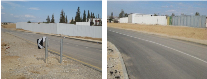
Figure 5 Umm Batin "saucer road" and metal walls marking land claims.

purpose. Umm Batin's main thoroughfare, colloquially referred to as the "saucer road" by ABRC engineers, took three years to build. The road narrows to bypass a resident's land (ABRC engineer 2 2011; ABRC Operations Director 2010). The street is so narrow that sidewalks could not be built, and it is lined with tall, metal walls that mark the limits of the resident's claims. Road signs have been removed or damaged. The researchers experienced how the road's irregular shape obscures visibility and compromises safety after a near-collision with an oncoming vehicle. Similarly, a gym in Umm Batin was reduced to one basketball court after a resident had marked his lands with a wall, blocking builders from constructing the full facility. An ABRC engineer who had worked on both projects could not understand why residents would oppose projects designed to serve them. "They all wanted the road, but now they are causing troubles that stop it," he remarked. "If you are looking for sense here, you are looking in the wrong place" (ABRC engineer 2 2011). The Umm Batin "saucer road" appears in Figure 5.