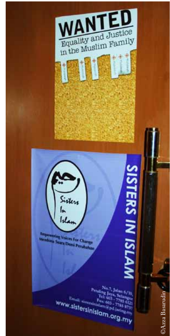
Sisters in Islam is an organization of Muslim professional women in Malaysia.

The idea for the Musawah movement materialized in 2006 in Kuala Lumpur, Malaysia, during SIS's International Consultation on "Trends in Family Law Reform in Muslim Countries." Scholars and activists from Southeast Asia, West Asia, Morocco, the United States, and Britain shared best practices strategies and cited successful family law reform campaigns in Turkey and Morocco as models for ensuring equality without exception. Conceptualized across national borders and inclusive of the diversity in the lives of Muslim believers, this initiative suggests that "women's demands for equality and justice are