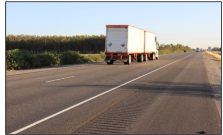
WMA field experiment

The testing completed in this phase of the warm-mix asphalt study has provided no results to suggest that warm-mix technologies should not be used in rubberized mixes in California, provided that standard specified mix design, construction, and performance limits for hot-mix asphalt are met.