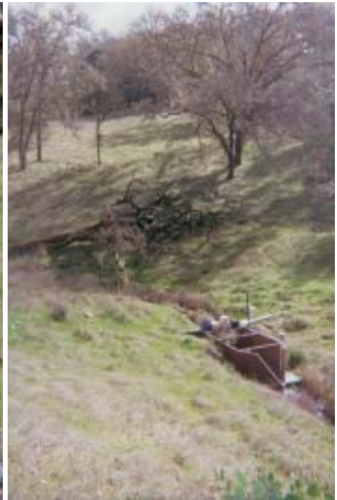
Stream flow and water-quality sampling equipment are located at the outlet of each experimental watershed. In coming years, studies will focus on the roles that grazing and fire management play in plant communities, hydrology and water quality.

events in the Russian River watershed. The data from Watersheds I and II further suggest that agricultural production practices in this region should maintain soil surface cover to enhance water infiltration and reduce surface runoff. Low ground cover leads to increased annual water yields, and especially increased summer/fall base flows. These can have benefits for anadromous fish species and the health and integrity of the aquatic ecosystem. Similarly, the conversion of ephemeral to perennial streams in upland watersheds will improve wildlife habitat by providing a summer source of water. However, these stream flow-related benefits came with associated, and significant, erosion problems.