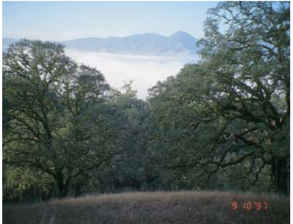
In the late 1990s, scientists launched a new series of studies on seven experimental watersheds at Hopland. Chaparral, left , is the dominant vegetation type on higher elevation (1,600 to 2,000 feet) watersheds, while oak woodlands, right , are typical at the lower elevations (500 to 1,000 feet).

next water year, resulting in greater water yields.