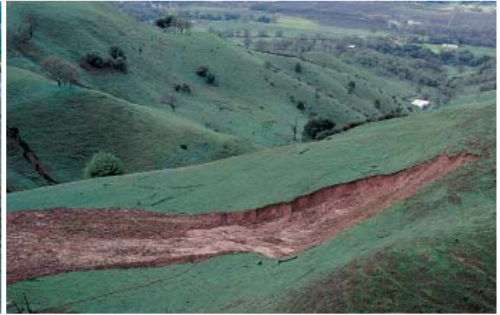
Between the late 1950s and early 1980s, watershed research at HREC focused on the impacts oak woodland-to-grassland conversion on water quantity, slope stability and erosion.