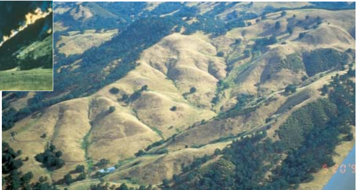
Watershed-scale research was initiated at the UC Hopland Research and Extension Center in the late 1950s. Vegetation on experimental Watershed II was cleared between 1960 and 1965, then burned.