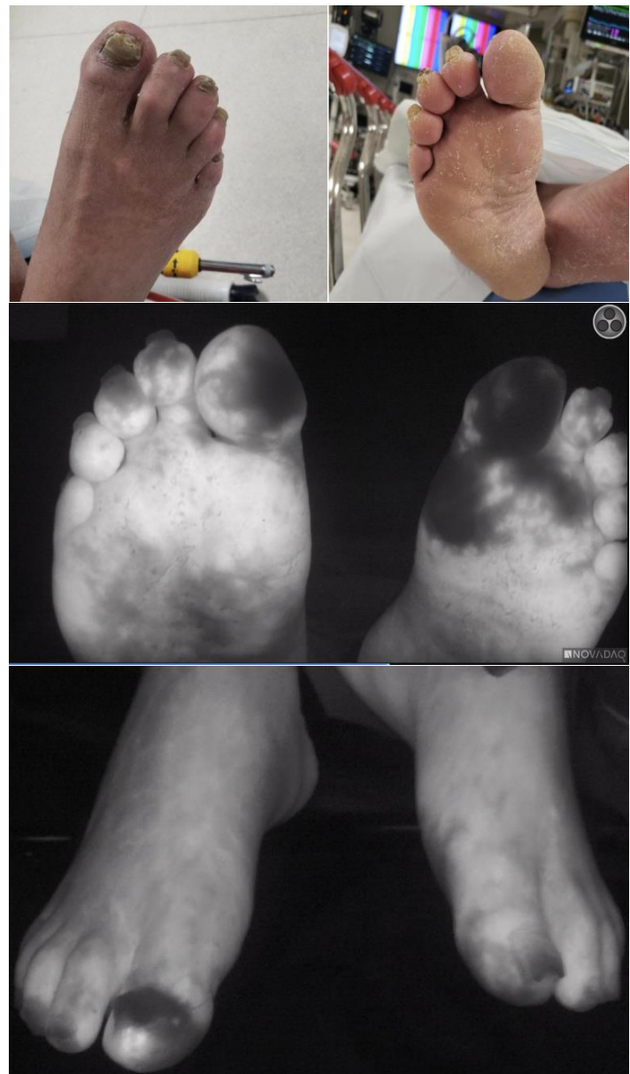
Figure 1. Use of bedside fluorescence microangiography in the emergency department for evaluation of a patient with possible frostbite. Lack of fluorescence (dark colored tissue in photos) indicates no fluorescein perfusion.

Historically, bone scans have been used at our institution to evaluate for perfusion deficits after severe frostbite injury.