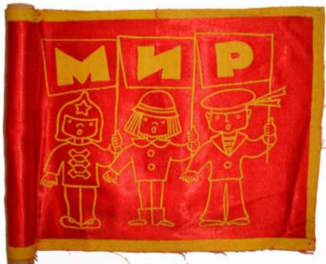
Figures 22–24 (top to bottom). Peace-themed flags including 1) a dove; 2) a red star with a dove, and text reading “Miru Mir!” or “Peace to the world”; and 3) three children holding small flags reading “Mir” or “Peace”.