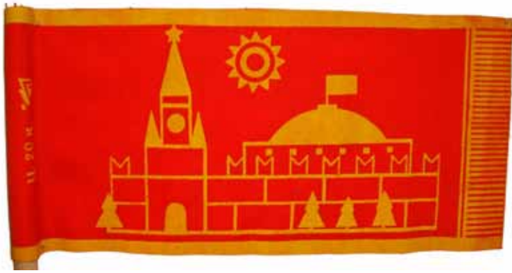
Figure 15. Patriotic symbols on holiday flag: the Kremlin as seen from Red Square.

the Kremlin is the burial place for the most respected heroes of the Soviet Union, with Lenin's tomb on the square just in front of the other memorials. Many parades and public demonstrations during the Soviet era took place in Red Square. 14