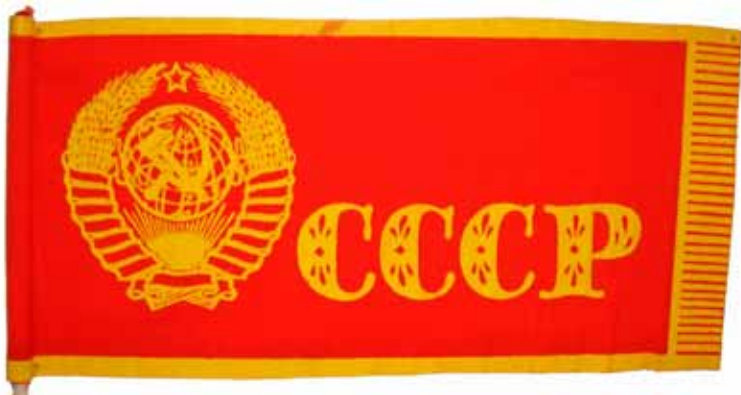
Figures 12–14 (top to bottom). Patriotic symbols on holiday flags: 1) hammer & sickle, poppies, dove, and text “With the holiday”; 2) Kremlin star, fireworks, and text “With the holiday”; 3) Soviet national arms with letters “SSSR” (USSR in Russian).