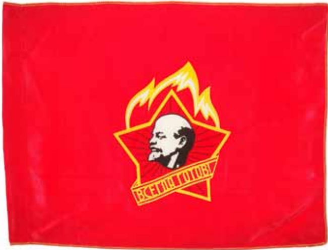
Figure 6. Flag of the Young Pioneers.