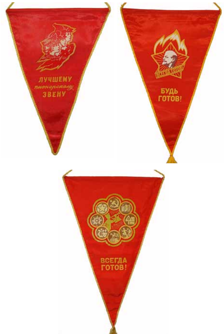
Figure 9. (upper left) Banner for the best Pioneer unit.