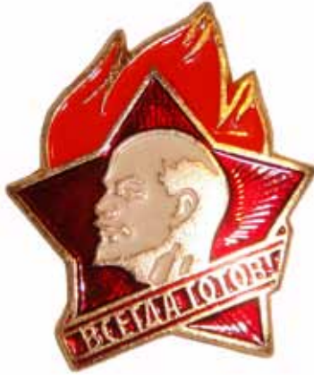
Figure 5. Badge of the Young Pioneers

respond “ Vsegda gotov! ”. The motto was a major element at the base of the Young Pioneer badge. Behind the motto was a red star with a profile of Lenin centered on it. At the top of the badge behind the star was a three-tongued flame, mildly reminiscent of the 3 petals of Scouting’s fleur-de-lis (Figure 5). The three tongues of the flame represented “the unbreakable alliance of the three generations: the Pioneers, the Komsomol , and the Communists, true to Lenin’s teaching and ready to fight for the Party cause”. 12