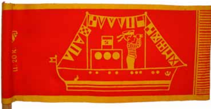
Figures 16–18 (top to bottom). Military symbols including 1) the Cruiser Aurora, symbol of the Russian Revolution; 2) a budenovka cap and sword; and 3) a young sailor on the deck of a small boat.