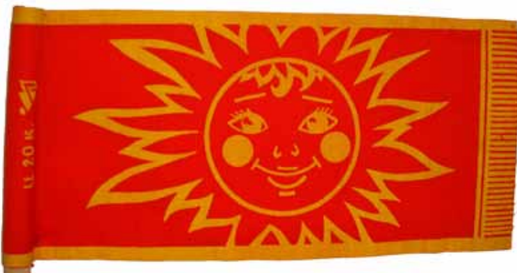
Figures 19–21 (top to bottom). Fun flag designs including 1) children of three races with the text “Druzhiba” or “Friendship”; 2) children drawing with the text “Pust’ vseгда budet solntse!” or “May there always be sunshine”; and 3) a smiling sun.