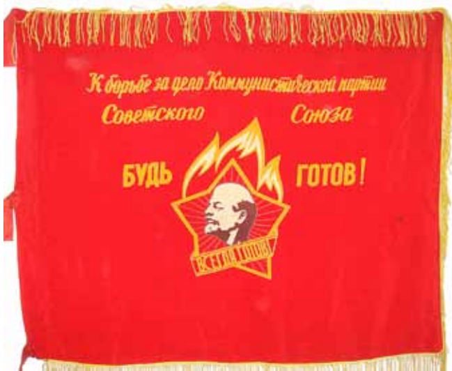
Figure 7. Alternate flag of the Young Pioneers.

The flag of the Young Pioneers had the Pioneer badge centered on a red field (Figure 6). Variant designs included the phrase “ Bud’ gotov ” along with the emblem. One example is a larger flag with the words “ Bud’ gotov! ” on either side of the Pioneer badge. Above the emblem in script is the phrase “ K bor’be za delo Kommunisticheskoi partii Sovetskogo Soiuza ”. Combined with the motto, the writing on the flag means “Be prepared to fight for the cause of the Communist Party of the Soviet Union” (Figure 7). These flags were used in ceremonies, parades, and demonstrations by all Pioneer groups in the Soviet Union and are often seen in photos and posters showing the activities of children in the organization. Combined with the badge and red scarf, the flags of the Young Pioneers were part of everyday life for Soviet children through the age of 15 and reinforced various aspects of the national symbolism of the Soviet Union.