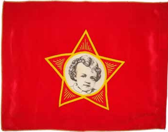
Figure 4. Flag of the Little Octobrists.

During their third year in the Octobrists, children began to learn about their country's national symbols. They were taught that the 5-pointed star symbolized the unity of workers from all five continents, 10 and that the hammer and sickle represented the workers and the peasants. They also learned about the symbolism of the Soviet arms. At the age of 10, Octobrists were ready to transition into the Young Pioneers. While most children eventually moved into the next level of the organization, they were admitted in small groups and it was considered very prestigious to be one of the first promoted from one's class. The promotion ceremony included a parade with bugles, drums, and flags. During this ceremony the initiates were presented with the badge of the Young Pioneers and with the red scarf worn by children throughout the Soviet Union. 11