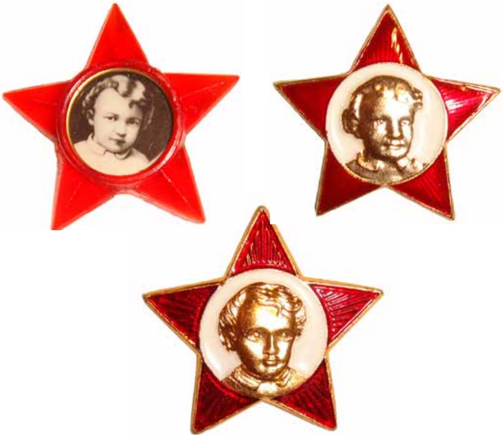
Figures 1–3. Badges of the Little Octobrists from various years.

At the age of 7, children were initiated into the Little Octobrists with a formal ceremony. They were taught that “Octobrists are hard workers, love school, and respect their elders; only those who love work are Octobrists.” During the ceremony, a Young Pioneer pinned the badge of the organization onto the left lapel of the new initiate. The emblem of the organization consisted of a red star with a portrait of a three-year-old Vladimir Ilyich Lenin in the center. While the look of the membership pin varied over the years, the basic design remained the same (Figures 1–3). After the initiation, the Young Pioneers would take charge of their “little stars” and present them with an Octobrist flazhok (little flag)—a small red flag featuring the Octobrist emblem (Figure 4). Octobrist groups used these flags during ceremonies and gatherings. 9