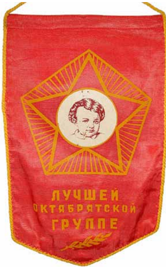
Figure 8. Banner for the best Octobrist group.

Pioneer award features profiles of three Young Pioneers, one wearing a forage cap, one a helmet, and the third a budenovka cap. Text below reads “ Luchshemu pionerskomu zvenu ”, or “To the best Pioneer unit” (Figure 9). A second example of a Young Pioneer banner shows the Pioneer badge with the “Be Prepared” motto below (Figure 10). The final example features a uniformed bugler with a flag attached to his bugle in the center. Around the bugler are discs with symbols illustrating the various activities of Young Pioneers. These include the primary Soviet symbols of a star, hammer, and sickle, as well as a 5-pointed star and items such as a book, campground, bugles, lyre and dramatic mask, and a nautical wheel. Below the image is the Pioneer motto “Always Prepared” (Figure 11). While the first two