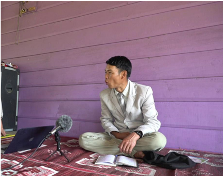
FIGURE 2 BuaLaj repeats sambaaj1 kwaa6 .

This presentational thematization of sambaaj1 kwaa6 —similar, perhaps, to your uttering of “exquisite” a few paragraphs ago—was achieved partly through signal-internal diacritics, which made the thematized sonic form pop. Like many such presentations, it also relied on metapragmatic signs outside of the signal. These also helped indexically focus in on and point toward the focal object-language (that is, the forms' suprasegmentals). In each