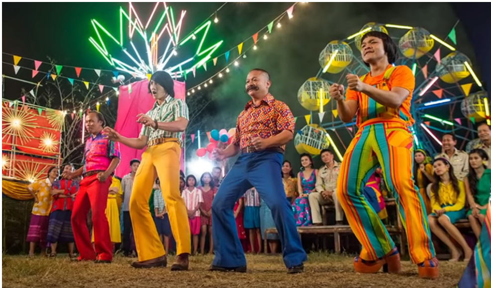
FIGURE 5 Characters in a Thai comedy sing an unintentionally vulgar song because of a tone pun.

While presentational thematizations are the most common way L1 Lao speakers outside the NNT Watershed thematize suprasegmentals, these speakers do sometimes thematize referentially. We have heard many times, for example, about how people in Luang Prabang speak ‘enjoyably’ ( muan1 ) and people in Pakse speak ‘strong’ ( hèeng2 ). So too do L1 Lao speakers often talk about lexical tonal distinctions by relying on the somewhat clumsy vocabulary provided by the orthography of Lao. We turn to this issue now.