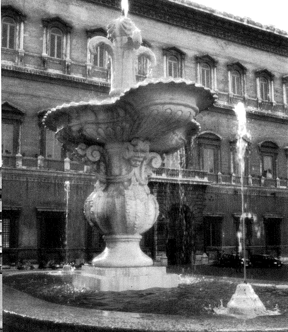
Left: The small Campitelli Fountain (only three meters high) is one of the last “children” of the Acqua Felice.

Three pre-industrial, gravity-driven aqueducts still operate: Aqueduct Vergine, Acqua Felice and Acqua Paola. The Vergine, based on the antique Aqua Virgo, was restored several times during medieval and renaissance times. By 1570 one branch arrived near the Piazza di Spagna, at 20.5 meters above sea level (masl). It served the low-lying, densely populated Campus Martius area. This supplemented an earlier branch that arrived at the site of the Trevi Fountain at 20 masl, and added a crucial half-meter of head to the water.