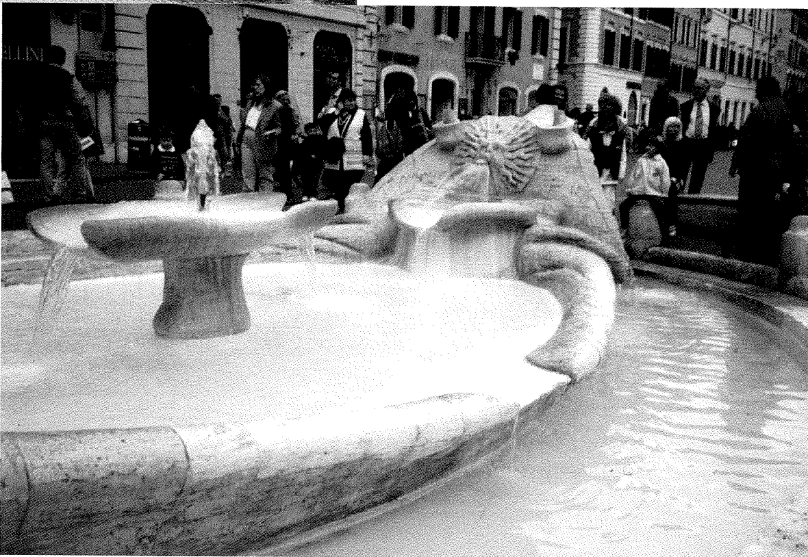
Right: The Baraccia is another member of the low-pressure Vergine family.