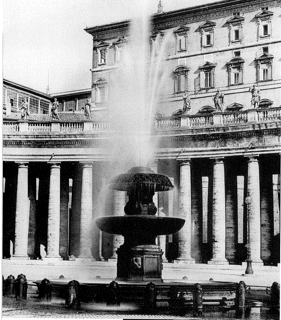
Above: The fountains of St. Peter's are fed by the high-pressure Acqua Paola system.