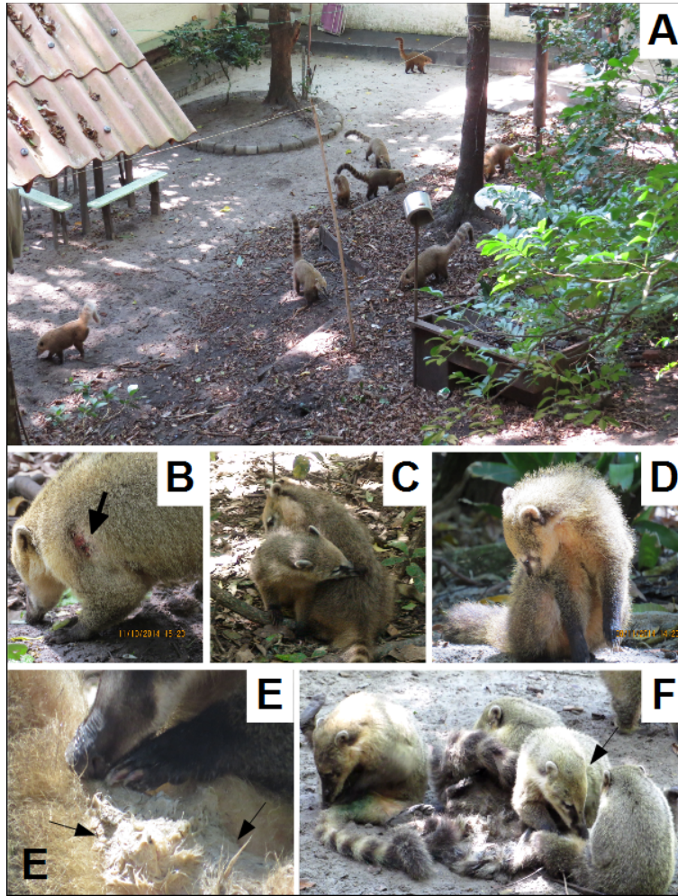
Figure 2. Nasua nasua on Ilha do Campeche (State of Santa Catarina, Brazil). A: group of ring-tailed coatis at the recreational area of Enseada Beach; B: an adult individual parasitized by ticks (arrow). From C to F, the behavioral categories of C: allogrooming; D: self-grooming; E: self-anointing, photo in close proximity showing the nose and paws of a ring-tailed coati rubbing his genital area plenty of suds (arrows); F: three self- and one allo-anointing behavior (the animal indicated by the arrow rubs the other that is self-anointing) in close social proximity.

Anointing was usually performed by both paw and mouth/nose (sometimes it was possible to see the teeth rubbing the fur; see Figures 1B and 2E). It lasted from a few seconds to almost five minutes. It was performed by all age classes, but as the number of animals per class is not equal, this ratio was not possible to calculate. Whenever the subject's sex could be identified there was an equal number of males and females (10 females, 9 males) involved. The individual self-directed act commonly started with one or a few individuals approaching and sniffing the deposited items independently, coming from different directions, and taking a piece of soap, holding it between its paws, biting and even chewing on it for a few minutes without body contact. The mixture of chewed-up soap and saliva formed suds that were then applied to the body. The genital area (see Figure 2E) and tail were the most frequently rubbed parts, occurring in 39 and 31 events, respectively. It was applied less frequently to the inner legs and sides of the body (8 events). It is worth noting that the genitals were most commonly anointed by males whereas females mostly rubbed their tails. Ring-tailed coatis would leave the place where they found soap and move to another location, even jumping into the trees, continuing to self-anoint without taking more soap but using what was already on their fur. Animals that