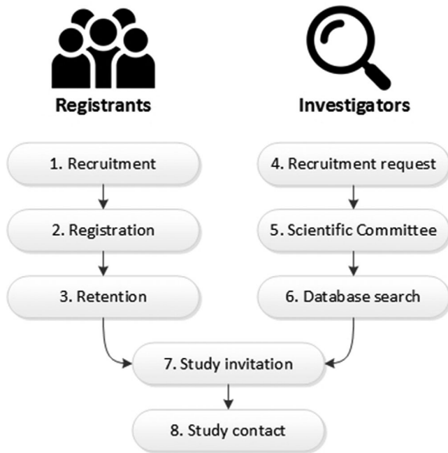
FIGURE 1 Overview of the registry journeys for registrants (left) and investigators (right)

information, presence of memory complaints, medical history, medication and substance use (see Appendix). After registration, registrants alternate between step 3 (Retention) and step 6 (Study invitation)