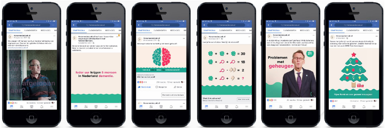
FIGURE 2 Facebook advertisement campaign for participant recruitment, including (from left to right) awareness video, brain fact pinned posts, brain quizzes, puzzles, one-minute academy videos, and weekly free posts