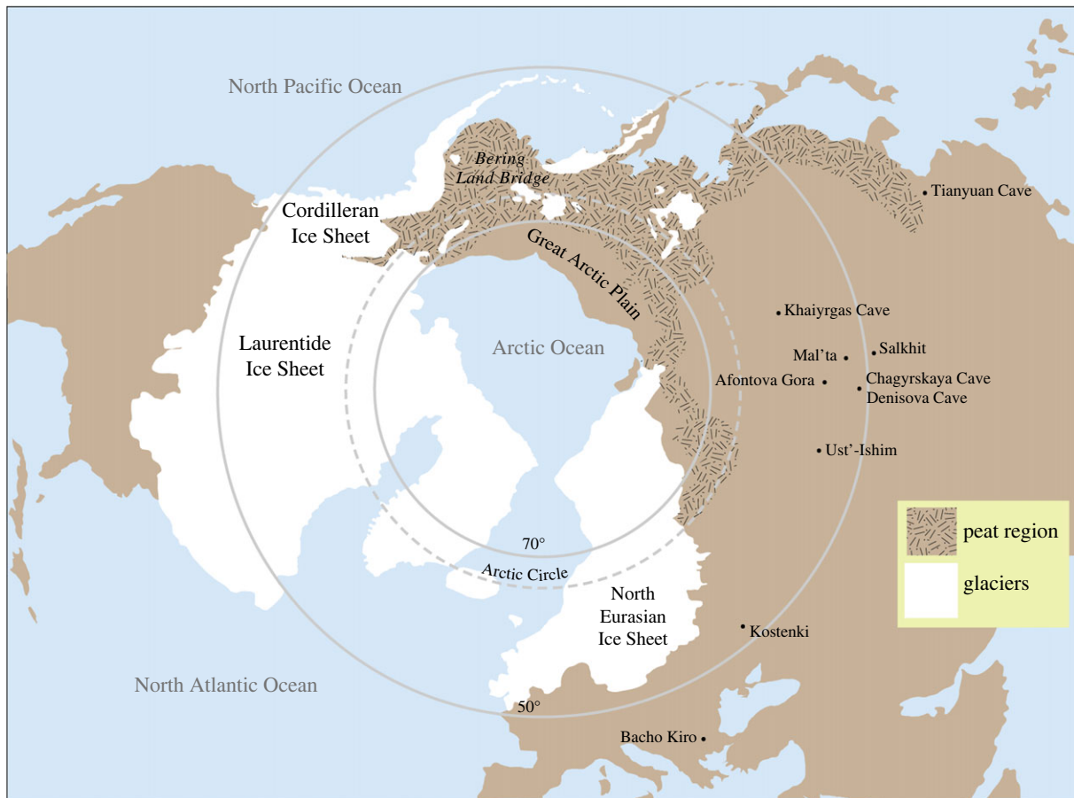
Figure 3. Glaciation in the Northern Hemisphere during the LGM, showing the extent of the peat region and location of sites in northern Eurasia mentioned in the text (adapted from Lindgren et al. fig. 1 [34]).

Pribilofs, was present. A seasonal resource in the form of migratory waterfowl, attracted to ponds and wetlands on the poorly drained BLB, also may have existed [35] (figure 3).