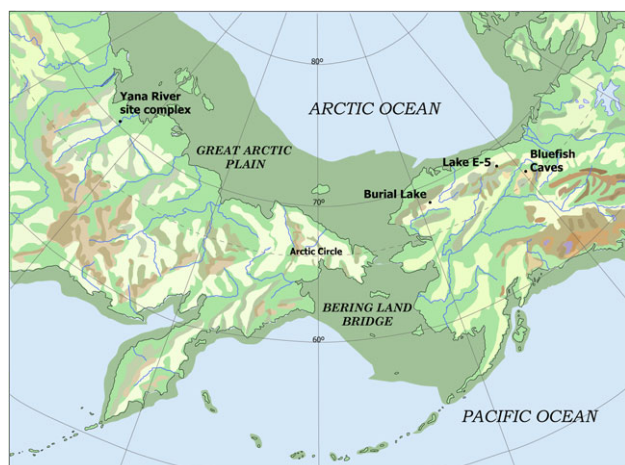
Figure 1. Map of Beringia, showing location of sites mentioned in the text.

In 1937, Eric Hultén proposed the palaeogeographic label Beringia for the exposed shelf areas in the Bering Strait region, which he hypothesized, based on modern plant distribution, had provided a refugium for arctic and subarctic plants during the cold-climate periods [3]. There are two such areas of continental shelf, both of which now are fully submerged. One is the Bering-Chukchi Platform , which adjoins Chukotka and western Alaska and often is equated with the ‘Bering Land Bridge’ (BLB). The other is the East Siberian Arctic Shelf , which extends from the Chukchi Sea to the western shore of the Laptev Sea and the Taimyr Peninsula (i.e. across the central and eastern Siberian Arctic). Although all the Bering-Chukchi Platform falls within the geographical definition of Beringia, the East Siberian Arctic Shelf occupies a larger region that lies outside both the original and later, expanded definitions of Beringia [4,5] (figure 1).