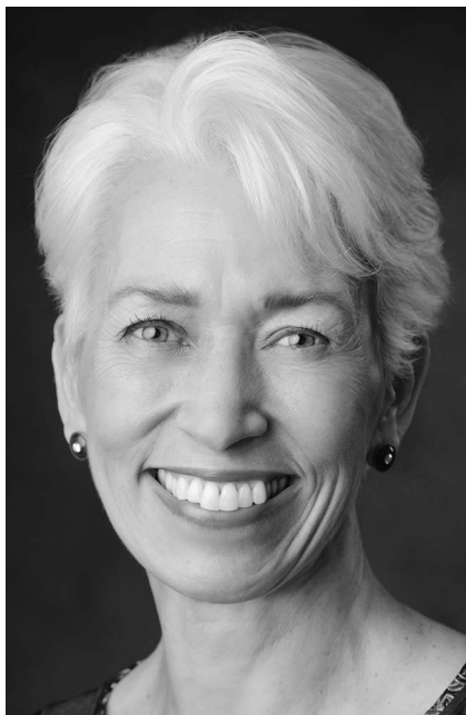
Nina G. Jablonski

Rejection and disrespect may have a more profound effect on youth than older adults. During adolescence, when passion and peer influence are rising but brain systems that support self-control and planning are not fully mature, the typical youth is more likely to engage in risky behaviors, especially in emotionally charged social circumstances (Steinberg, 2008). However, the vast majority do not exhibit violence as a result of extreme reactivity and risky decision making (Frick & Viding, 2009). Moreover, violence could emerge at any time in the life course in reaction to identity-challenging stress and factors that compromise self-control such as substance abuse.