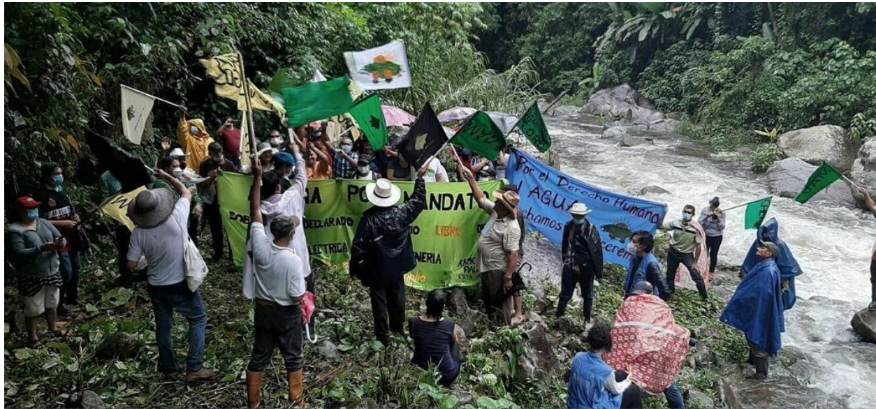
Figure 6. Residents protesting against the Jilmito Hydroelectric Project in Arizona, Atlántida.

dispossessing Indigenous and community members of their lands and access to safe potable drinking water.