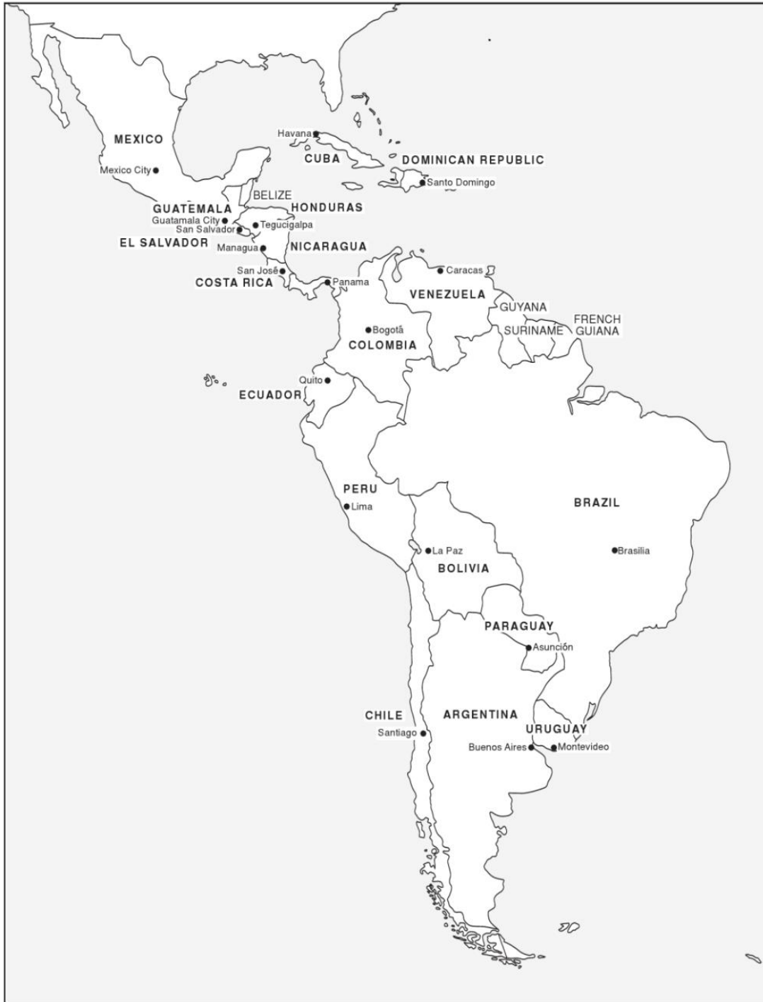
Figure 4. Map of Latin America. Map from (Gwynne & Cristóbal 2014, 4).