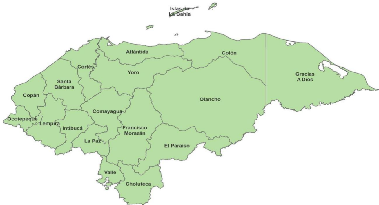
Figure 1. Map of Honduras and its 18 municipalities. Data from (Esri et al. 2023).

Atlántida, like many other regions in Honduras, has seen a large increase in extractive hydroelectric, mining, deforestation from African Palm tree cultivation projects and illegal logging that endangers the dispossession of Indigenous communities, undermining their sovereignty and affecting the lives of thousands. This particular region was selected due to its diverse levels of urban development and ongoing environmental injustices (Figure 2).