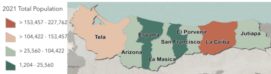
Figure 2. Depiction of the municipalities in the Department of Atlántida with 2021 total population count distribution. Data from (Esri et al. 2023).

The Department of Atlántida is projected to have a total population of 508,228, with 164,626 of that population being rural, and 343,602 residing in urban areas by 2023 (INE 2023) (Figure 2). The department is made up of 8 municipalities and borders the Gulf of Mexico: Tela, Jutiapa, San Francisco, El Porvenir, La Masica, Arizona, Esparta, and lastly, its departmental head, La Ceiba. La Ceiba, Tela, Arizona, Esparta, and San Francisco have varying degrees of urbanization. La Ceiba has the highest level of urbanization at 92.81%, San Francisco is second with 76.77%, Tela is third with 53.08%, Arizona is fourth with 50.55%, and Esparta is last with 100% rural (INE 2015). Interestingly, each area is being confronted with the same problems surrounding water supply shortages and struggling to meet those demands. As neoliberal development frameworks have prevailed across the nation, water sources have become commodities, sparking conflicts over access between citizens, the government, and businesses. According to Movimiento Amplio por la Dignidad y la Justicia, the Department of Atlántida has 73 rivers and streams, 42 of which are officially protected, that are being threatened by 24 hydroelectric concessions, 5 of which are already in operation (Radio Progreso 2017). The concession of these rivers and streams to businesses is oftentimes illegal as they violate the “ International Labor Organization (ILO) Convention No. 169 ratified by Honduras in 1994,