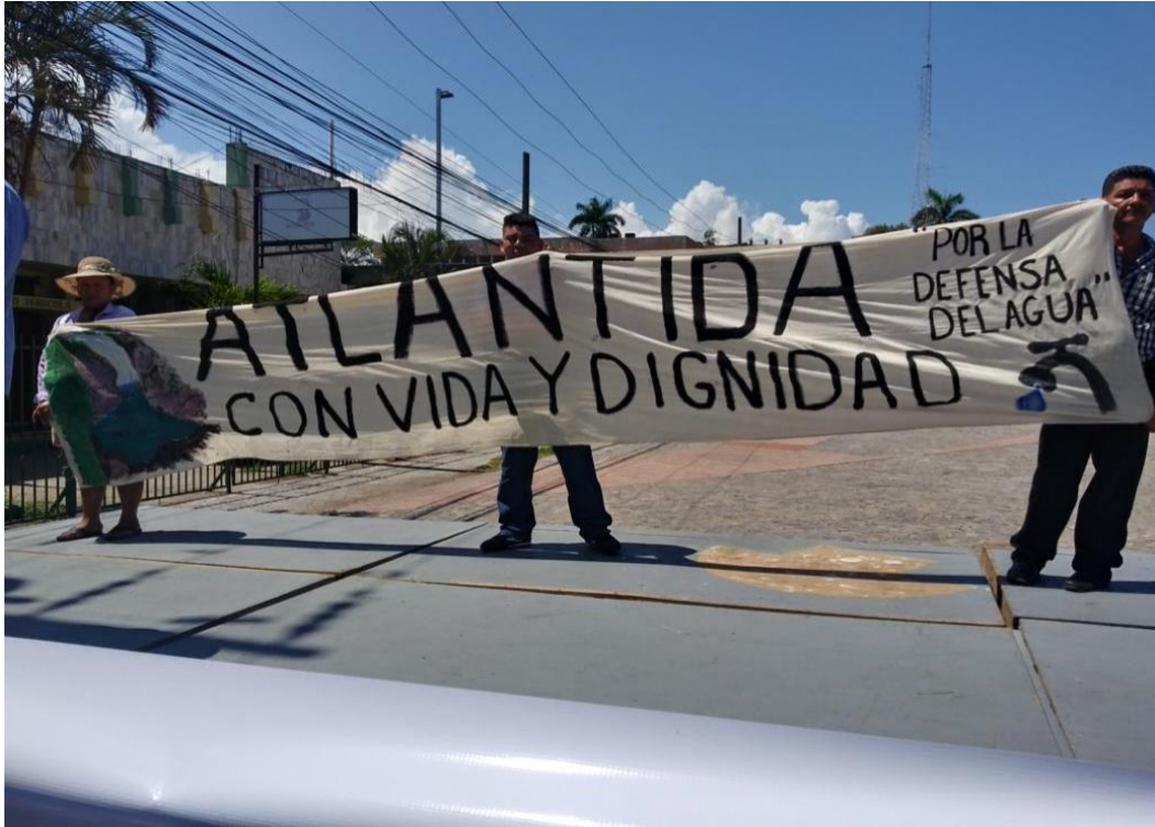
Figure 3. Atlántida community members protesting to defend water resources in the area.

with limited political and economic influence. This compels the country to continue its reductionist role or risk exclusion from the system altogether.