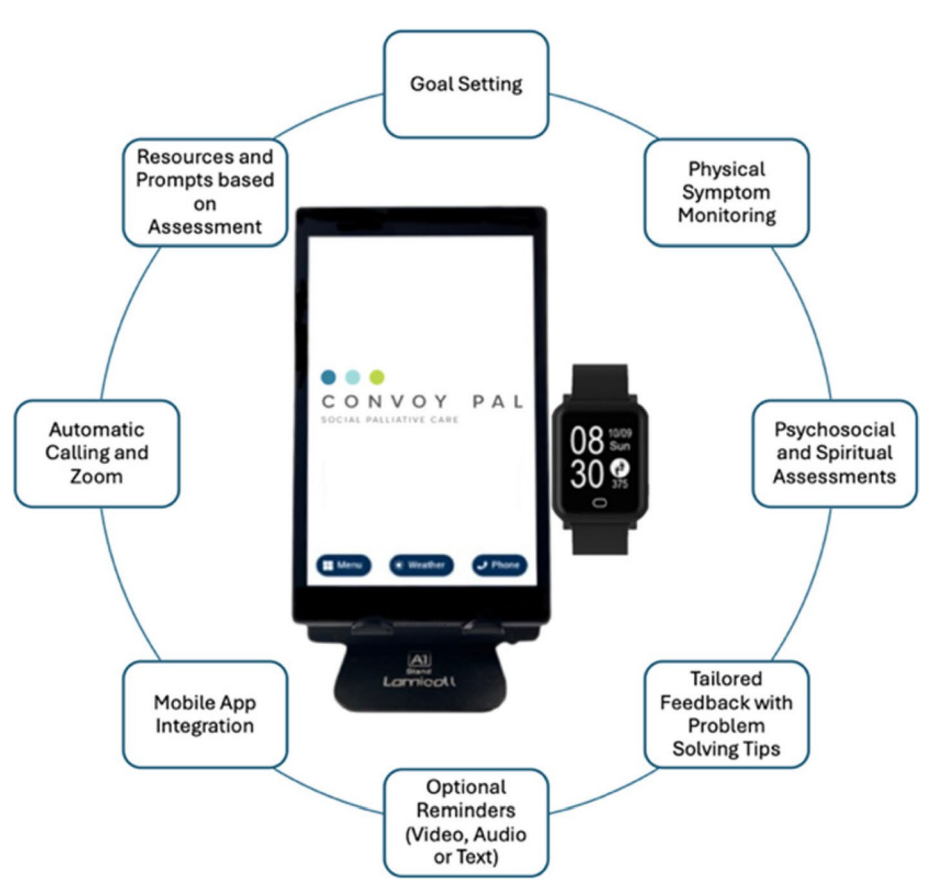
Fig. 2 Convoy-Pal Features

via self-repot weekly, along with smartwatch tracking of steps, heart rate, blood pressure, and skin temperature. Users could review an overview of their symptom reports and smart watch data on the tablet and website dashboard. Each week, users were prompted to complete a different palliative care assessment related to symptoms, advance care planning, spiritual needs, anticipatory grief, health team concerns, and social support. Assessments were specific to the patient or caregiver. Based on user responses, Convoy-Pal replied with a message of encouragement (e.g. it sounds like you have a lot of friends and family to lean on right now) or prompted a credible palliative care resource (e.g. based on your responses, Convoy-Pal can help you connect to supports). For example, if users reported low social support, Convoy-Pal provided resources on finding a support group for social support. If participants reported low satisfaction with their health care team, resources on preparing for visits, asking questions, and improving patient-provider communication were provided. Patients and caregivers shared access to each other's information dashboard via the system portal and mobile app.