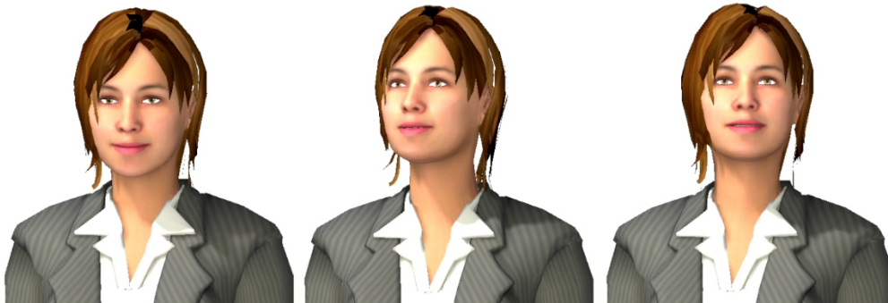
Figure 1: The three main postures of Embr in the AVERT condition. From left to right: Mutual gaze - Gaze to upper left - Averted gaze to the right towards turn end.

We created four lists using a Latin Square design, so that